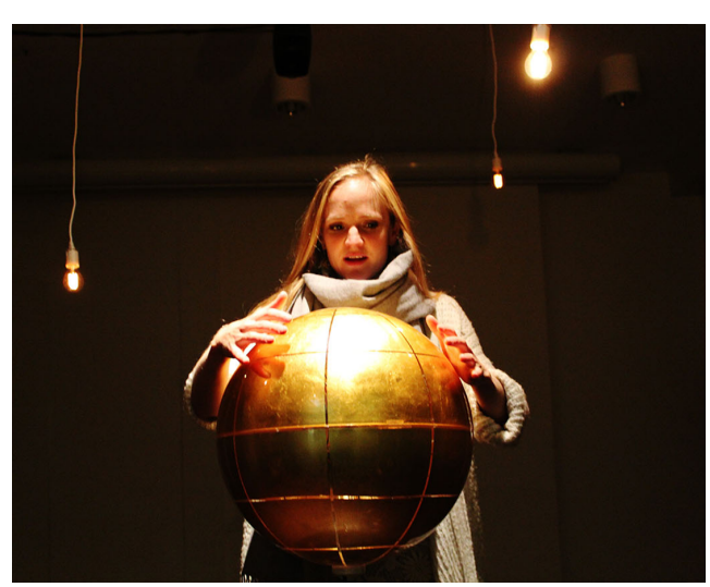
Figure 3. Somatic interaction with the golden sphere, functioning as electronic skin.

In the middle of the installation space the golden sphere acts as a controller for both the real-time composition as well as the listeners' experience. Around the performer there were up to 30 loudspeakers placed in a hemispherical setup at about two meters from the epicentre. (Figure 1)