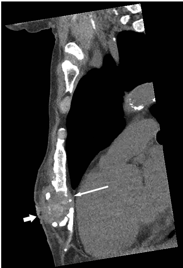
Figure. Computed tomography scan of the chest wall (sagittal section, bony windows) of man from Kenya with Candida auris sternal osteomyelitis, Australia, 2015. Image shows bony erosion and fragmentation of distal sternum (thin arrow), together with a 3.3-cm abscess and a sinus tract in the subcutaneous tissues (thick arrow).

We performed whole-genome sequencing (WGS) on the isolate (FSMC57608) using the NextSeq platform (Illumina, https://www.illumina.com/ ) and then assembled Illumina paired-end sequencing data using SPAdes, St. Petersburg genome assembler 3.1.1 ( http://spades.bioinf.spbau.ru/release3.1.1/manual.html ). We identified core genome single-nucleotide polymorphisms (SNPs) using Snippy version 4.0 ( http://www.vicbioinformatics.com/software.snippy.shtml ), using the C. auris B8441 genome for reference and previously described methods (2), and mapped \approx 97.77\% of the reads. A maximum-parsimony phylogenetic tree was constructed by using MEGA version 7.0 ( https://www.megasoftware.net/ ) and 10 other C. auris genomes (2). Results showed that FSMC57608 (GenBank accession no. SRP156632) is a South Africa clade III isolate (Appendix Figure 2) with SNPs V125A and F126L and wild-type at amino acid positions 132 and 143 of Erg11 (gene associated with azole class antifungal drug resistance) (Appendix Figure 3).