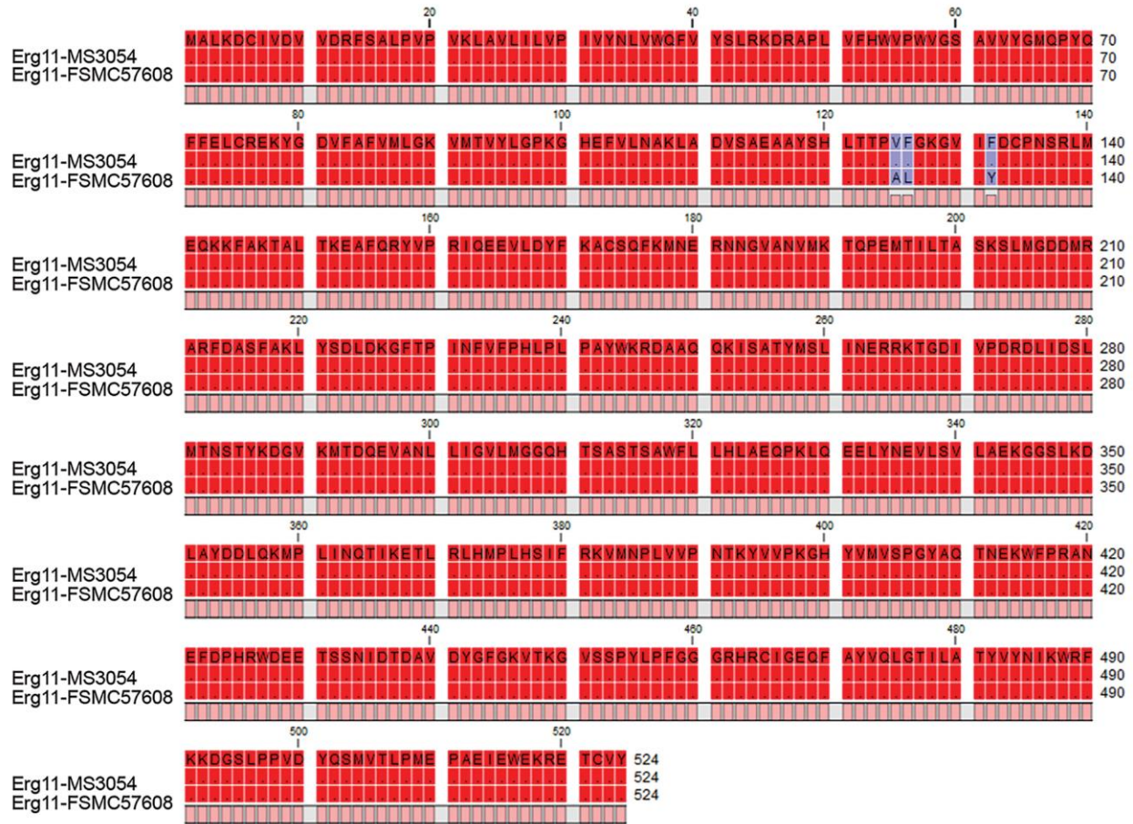
Appendix Figure 3. Erg11 sequence comparison demonstrating single-nucleotide polymorphisms (SNPs) V125A and F126L in FSMC57608 (GenBank accession no. SRP156632), Australia, 2015. MS3054 is a clade I Candida auris isolate from India used for comparing the Erg11 sequence. FSMC57608 is wild type at amino acid positions 132 and 143.