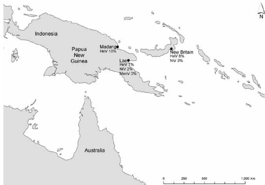
Figure. Sampling locations and henipavirus antibody prevalence, Papua New Guinea 1996–1999, among 182 wild-caught fruit bats from Madang (1996), New Britain (1997), and Lae (1999), Papua New Guinea. HeV, Hendra virus; NiV, Nipah virus; MenV, Menangle virus.

Of the 20 samples from Madang, 2 (10%) reacted in the Hendra virus ELISA. Of the 147 samples from New Britain and Lae that yielded definitive VNT results, 11 (7.5%) yielded neutralizing antibodies to Hendra virus and 5 (3.4%) to Nipah virus. All samples with antibodies against Nipah virus also had antibodies against Hendra virus; titers against Hendra virus were greater (4 samples) or equivalent (1 sample) to those against Nipah virus. Reciprocal titers against Hendra virus were 5–160 (median 10) and against Nipah