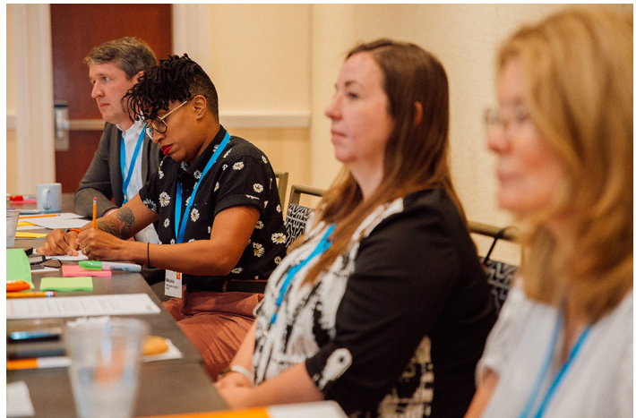
WKKF Listening Session