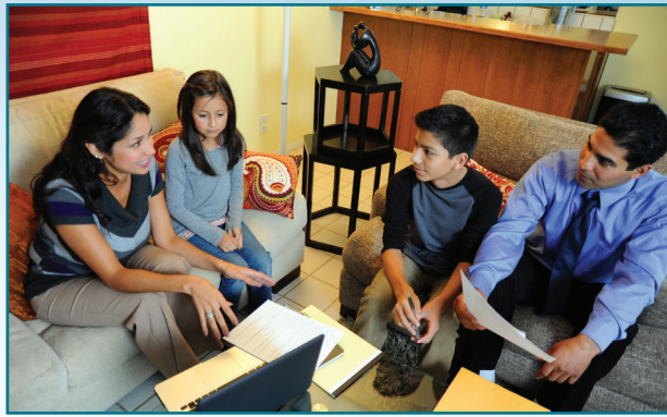
Discuss your plan with your loved ones.

If you are visiting the coast , find out about local tsunami safety. Your hotel or campground should have this information.