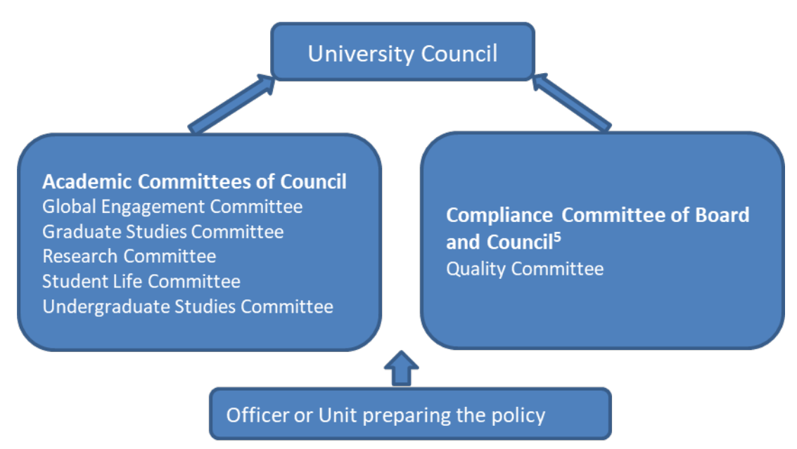
Fig 3: Approval pathway for Academic Policies