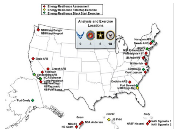
Figure 2. Site-level map of energy resilience assessment locations

Marine Corps Recruit Depot (MCRD) Parris Island: MCRD Parris Island completed a Climate Change Adaptation and Resilience (CCAR) assessment that resulted in changes to its master plan projects and adaptation strategies from spatial planning; to redirecting development away from high-risk areas; to infrastructure projects to manage and respond to sea level rise and effects of climate change. Adaptation projects include stormwater system upgrades, battalion training facilities elevation (main campus), road network upgrades, tidal exclusion barrier, page field training facilities relocations, and reforestation.