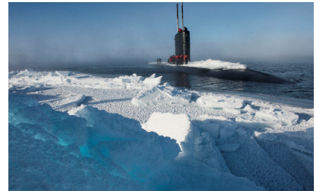
The submarine USS Hartford surfaces near Ice Camp Sargo during Ice Exercise 2016 in the Arctic Circle, March 19, 2016.

Climate considerations must continue progress toward becoming an integral element of DOD’s enterprise-wide resource allocation and operational decision-making processes. Climate assessments must be based on the best available, validated, and actionable climate science that informs the most likely climate change outcomes. Climate data sources must be continuously monitored and updated—with consideration of the operational impact—to account for the rapid rate of climate change and its impacts. All other actions in this plan are dependent on the outcomes of this effort.