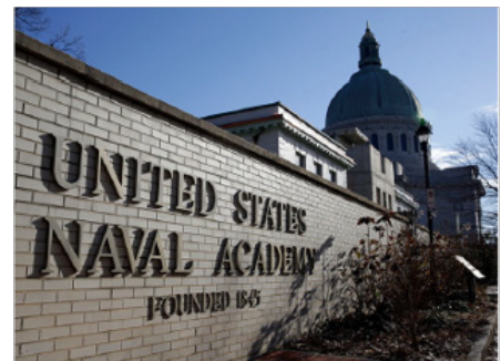
An entrance to the U.S. Naval Academy campus in Annapolis, Maryland (January 9, 2014).