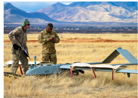
Soldiers conduct unmanned aerial system training for readiness-level progression at Fort Huachuca.