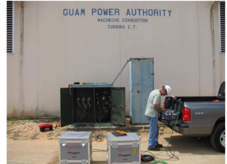
Guam Power Authority employee tests equipment for military installations on Guam.

A DOD-funded resilience study (FY 20–22) will result in a comprehensive plan with specific courses of action to cohesively address and mitigate the combined effects of land subsidence, sea level rise, ground water change, coastal flooding/storm surge, and inadequate stormwater management at USNA. Courses of action will include a mix of approaches: structural (seawalls, bulkheads, floodwalls, stormwater retrofits), natural (earthen berms/levees, rain gardens, living shorelines), non-structural (changes in land use), and temporary solutions to issues where long-term permanent protection may take years to implement. The installation is in the midst of implementing additional stormwater repair projects and proposing to repair and restore the seawall and shoreline along the installation to address structural deficiencies on the existing seawall and potential impacts from future extreme weather events, storm surge, sea level rise, and land subsidence.