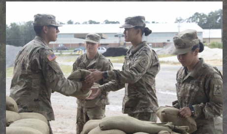
On September 5, 2019, trainees at Fort Jackson, S.C., stack sandbags for use throughout the hurricane season. The Army recently introduced a new directive to prepare the service's installations against the growing threat of climate change.