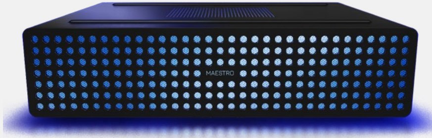
Fig 2: MAESTRO is the brain of the system