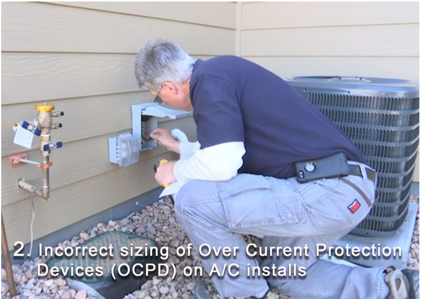
2. Incorrect sizing of Over Current Protection Devices (OCPD) on A/C installs