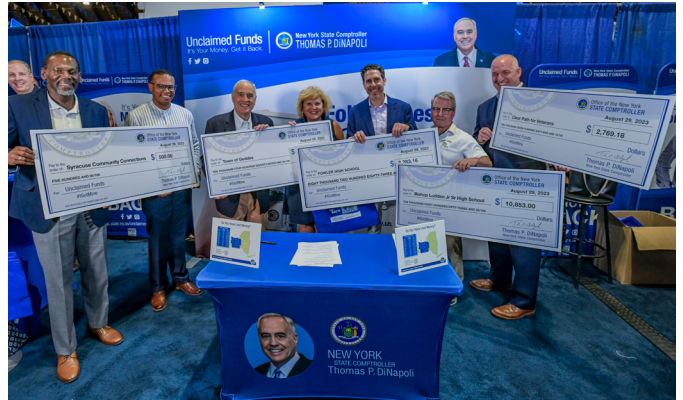
Comptroller DiNapoli at the New York State Fair in 2023 returning lost money.