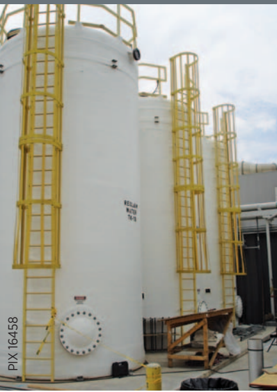
Holding tanks for the Sandia water reclamation system.

The U.S. Department of Energy's (DOE) Federal Energy Management Program (FEMP) facilitates the Federal Government's implementation of sound, cost-effective energy management and investment practices to enhance the nation's energy security and environmental stewardship.