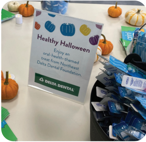
The Foundation awarded a $5,000 grant to the Children's Museum & Theater of Maine for its Healthy Halloween exhibit.

The Northeast Delta Dental Foundation is the bedrock of our philanthropic mission to improve access to quality oral health care across our Maine, New Hampshire, and Vermont communities. Our Foundation is helping bring more healthy smiles to the uninsured and underserved communities across the tri-state region through financial support for education and dental care services. Here are a few examples of our Foundation's impact in 2022.