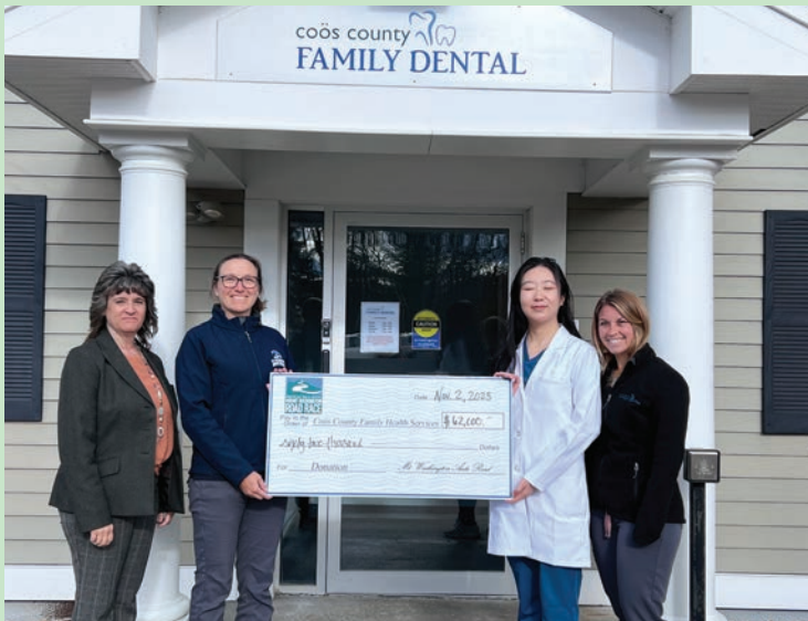
The Mount Washington Auto Road and Northeast Delta Dental proudly presents Coös County Family Health Services with $62,000 raised from the Delta Dental Mount Washington Road Race.

250+ LOCAL NOT-FOR-PROFIT ORGANIZATIONS WITH WHICH NORTHEAST DELTA DENTAL COLLABORATES.