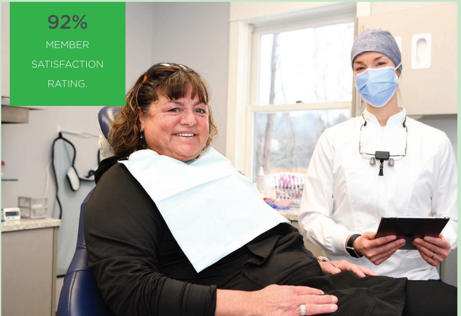
A registered dental hygienist reviews the HOW® and PreViser® report with a patient.