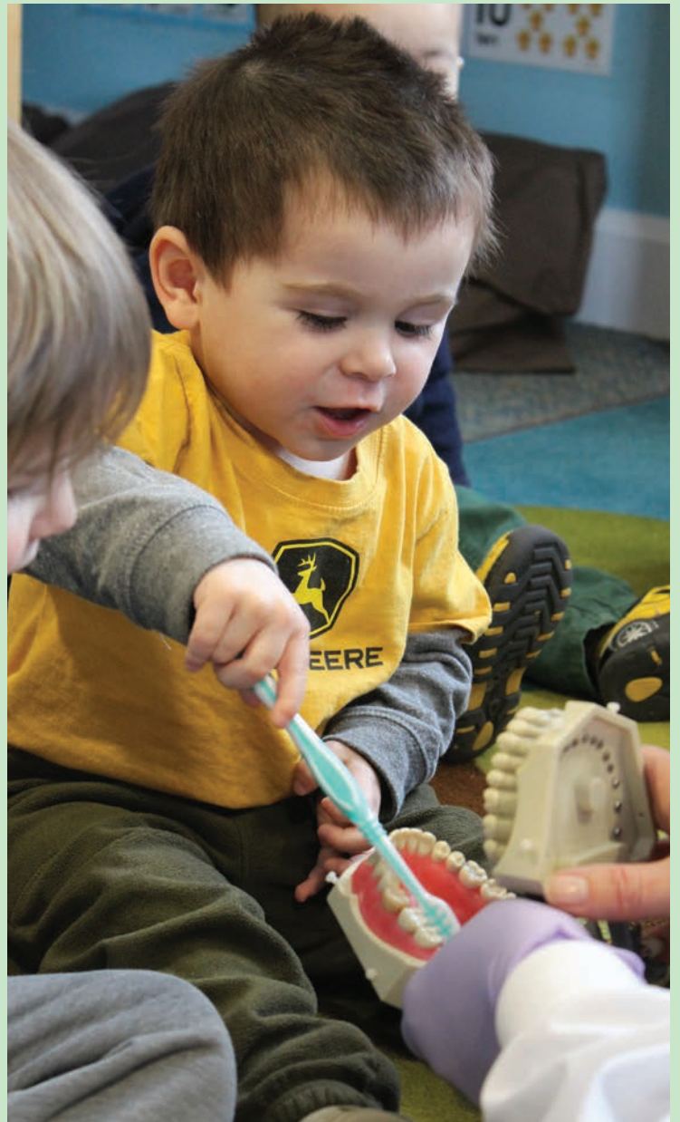
A toddler learning the value of good oral health care at Battenkill Valley Health Center.