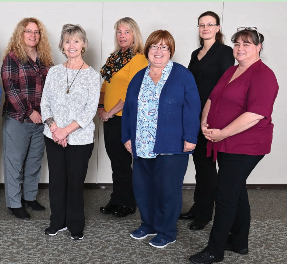
Northeast Delta Dental's Claims Edit Department.