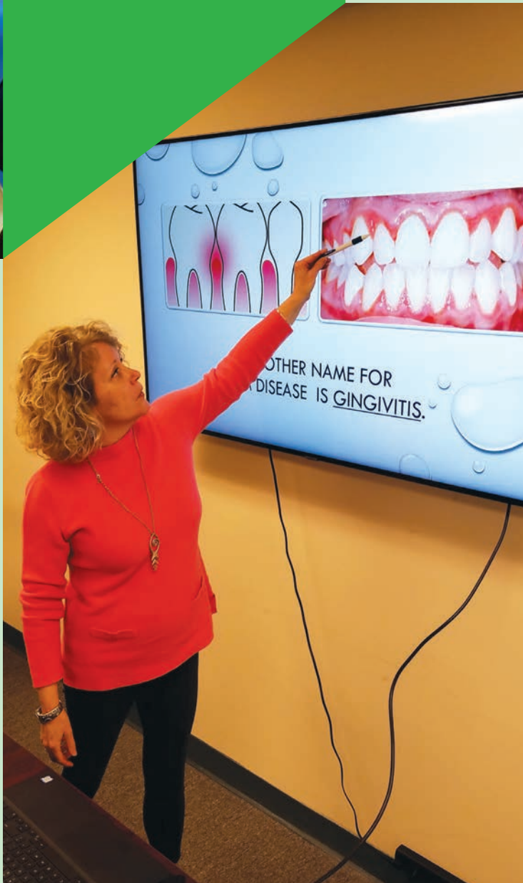
An instructor from The PLUS Company conducting a preventive oral health class.

Through their grant-funded outreach efforts, Battenkill Valley Health Center (BVHC), has helped to reduce dental fear, provided oral health education, and connected people with a dental home.