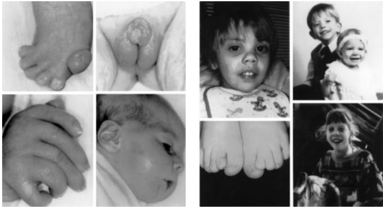
Figure 1 Patients with Smith-Lemli-Opitz syndrome.

than half of the patients have ptosis, often asymmetrical or unilateral. The palpebral fissures are usually straight, but both upward and downward slanting occurs. Other less frequent external eye anomalies include hypertelorism, epicanthic folds, absence of lacrimal puncta, 42 and unusually long cilia. 43 Mild exophthalmos has not been reported often, 2 but is relatively commonly seen in figures in publications. Ocular defects include mainly congenital and occasionally postnatal cataracts, strabismus, and nystagmus. 11 44-46 Vision is usually normal. Less common symptoms are sclerocornea, 13 43 47 heterochromia iridis, 48 coloboma of the iris, 16 42 posterior synechiae, 6 45 49 glaucoma, 2 12 retinal hyperpigmentation, 2 optic atrophy, 2 12 45 optic pits, 42 microphthalmia, 5 23 and abnormalities of eye movements. 44 Aniridia was reported by Gracia et al. 50 but the diagnosis in this mentally normal child with bilateral gonadoblastoma may be questioned.