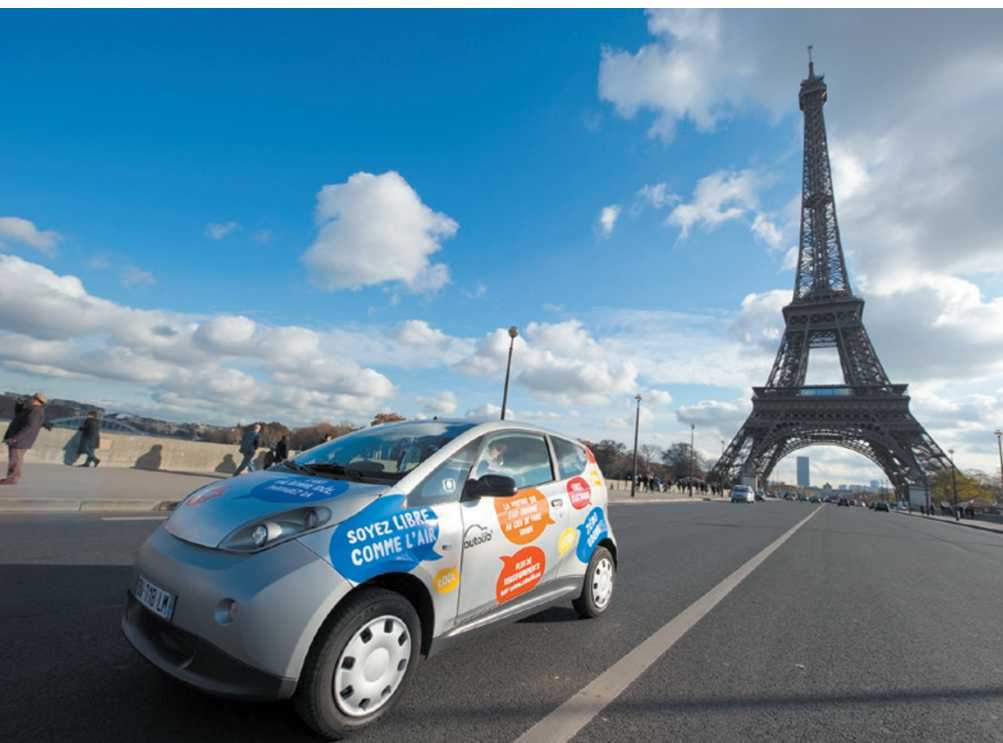
Autolib car-sharing schemes free users from the demands of ownership.