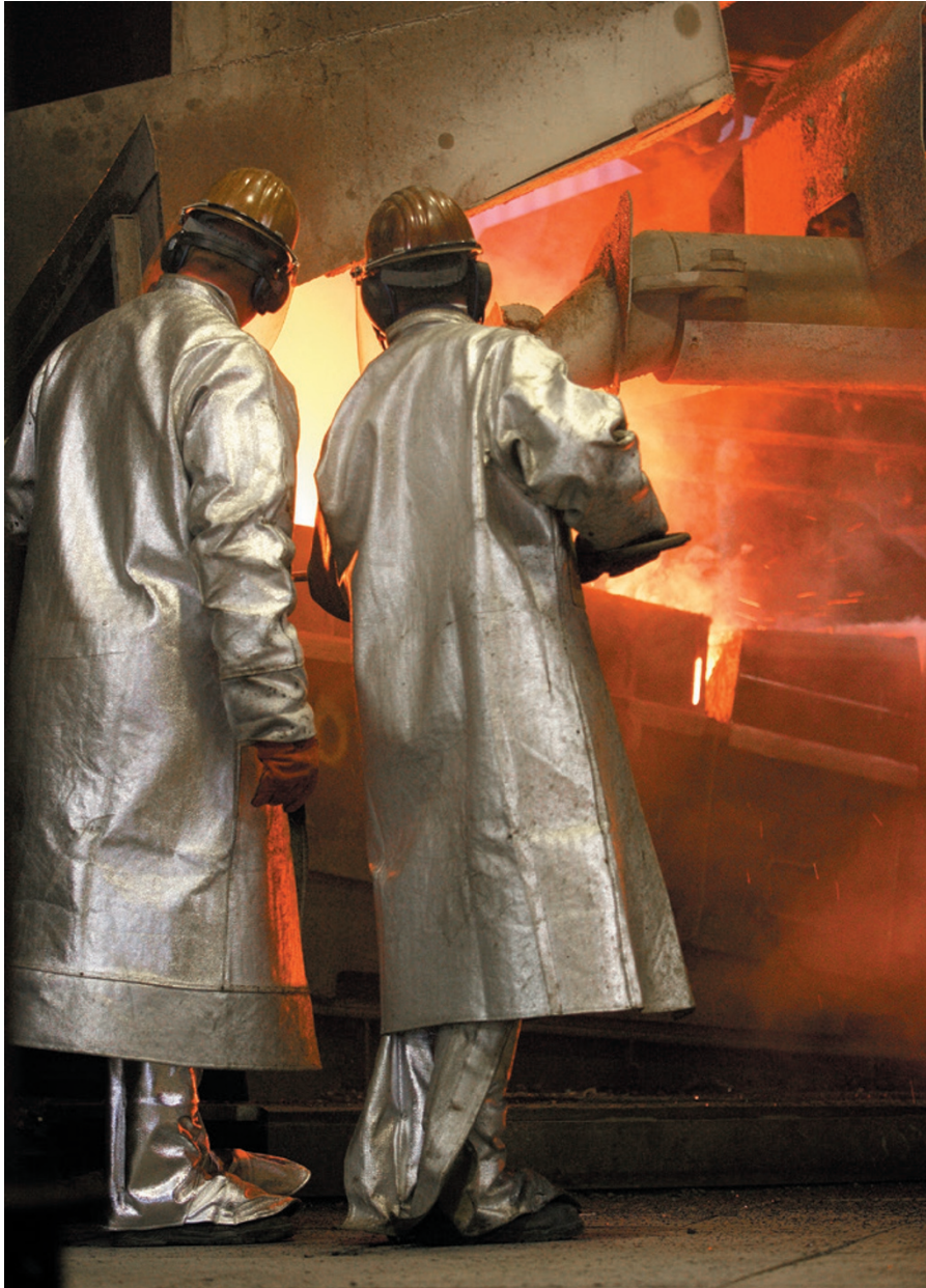
Workers at Umicore in Brussels separate out precious metals from electronic waste.