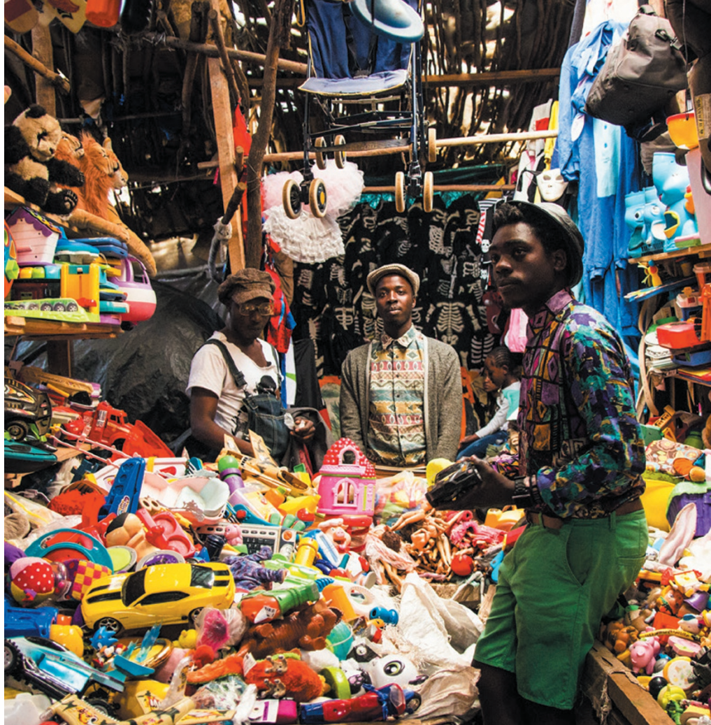
Stalls known as mtumbas ('second-hand' in Swahili) in Nairobi sell repurposed goods, many from the West.