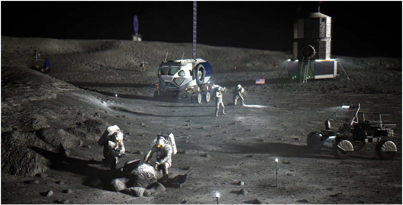
Concept image showing multiple technologies at the Moon that can be applied to Mars.

The three companies working on NASA's Artemis human landing system (HLS) will face different entry, descent and landing (EDL) challenges than a Mars lander will, but the agency expects to glean significant Mars-forward experience from the ascent part of the HLS system that launches crew back to orbit after their expedition is complete. The mechanics of the ascent system and the cryogenic propellant storage solutions used to prevent loss or "boiloff" of cryogenic fuels will be particularly applicable to future Mars missions. Modern human landing systems also will use advanced terrain-relative navigation technologies to support autonomous precision landing that will provide real-time avoidance of hazards such as large rocks and steep slopes or previously emplaced mission assets.