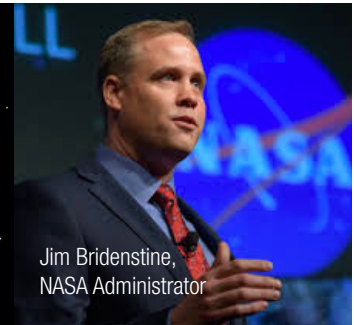
Jim Bridenstine, NASA Administrator

“ NASA has always set its sights on human exploration of Mars. Now with humans returning to the Moon in four years to establish sustainable lunar exploration by the end of the decade, we are able to clearly see the Moon is a critical stepping stone to the Red Planet. Learning to live and work on the Moon will bring us closer and closer to our next giant leap as we search for life farther in the solar system. ”