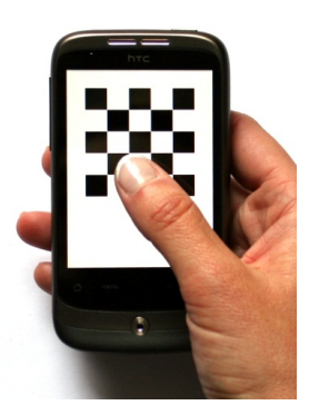
Fig. 1. PVT-Touch running on an Android phone, with stimulus visible. The checkerboard pattern provides a high-contrast, obvious signal to participants.

The original implementation of PVT was on purpose-built hardware designed for lab use only [1]. However, researchers are moving toward mobile implementations in order to assess sleepiness in everyday life and to gather more ecologically valid data. An implementation for Palm OS [3] that has users press a physical button on a PDA is currently the most widely adopted version. Unfortunately, Palm OS devices are no longer being manufactured as of 2009<sup>1</sup>, so use of this version is unsustainable for researchers and requires users to carry an additional device. Implementations for more current mobile touchscreen platforms, such as iOS and Android, would allow these assessments to be used in research studies and for con-