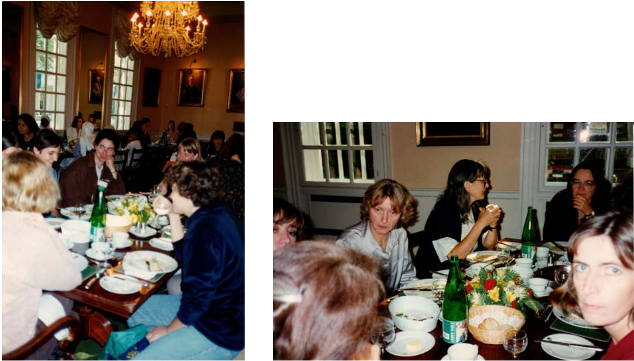
FIGURE 1. Dinner at the 1995 workshop at Imperial College.