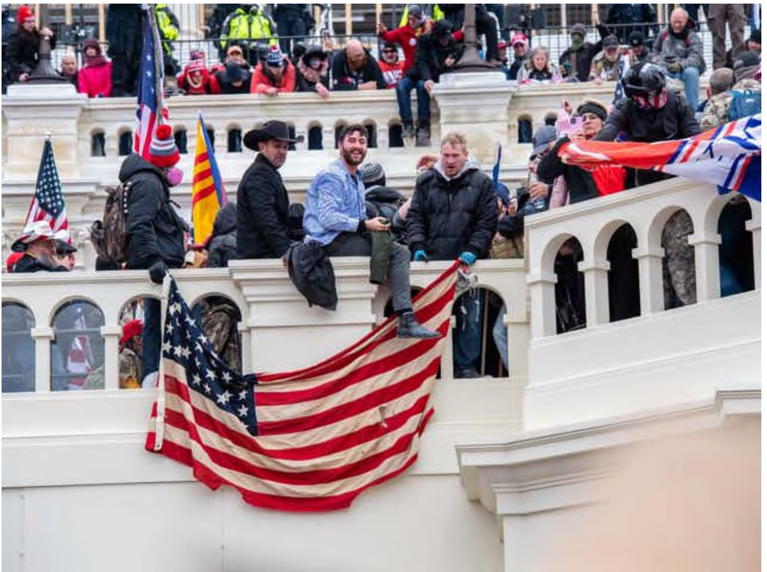
People sit atop railings outside the windows of the U.S. Capitol building.

Waves of people started coming to the front and at that point, she decided to shoot photos from scaffolding set up for the inauguration rather than go onto the Capitol steps. Taking photos near about 10 other photojournalists, she heard people saying that someone had gotten inside.