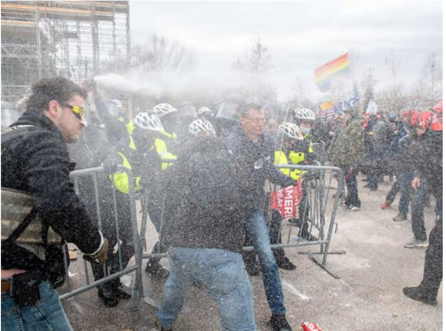
Police and protesters clash at Wednesday the U.S. Capitol.

5:19 pm EST January 7, 2021