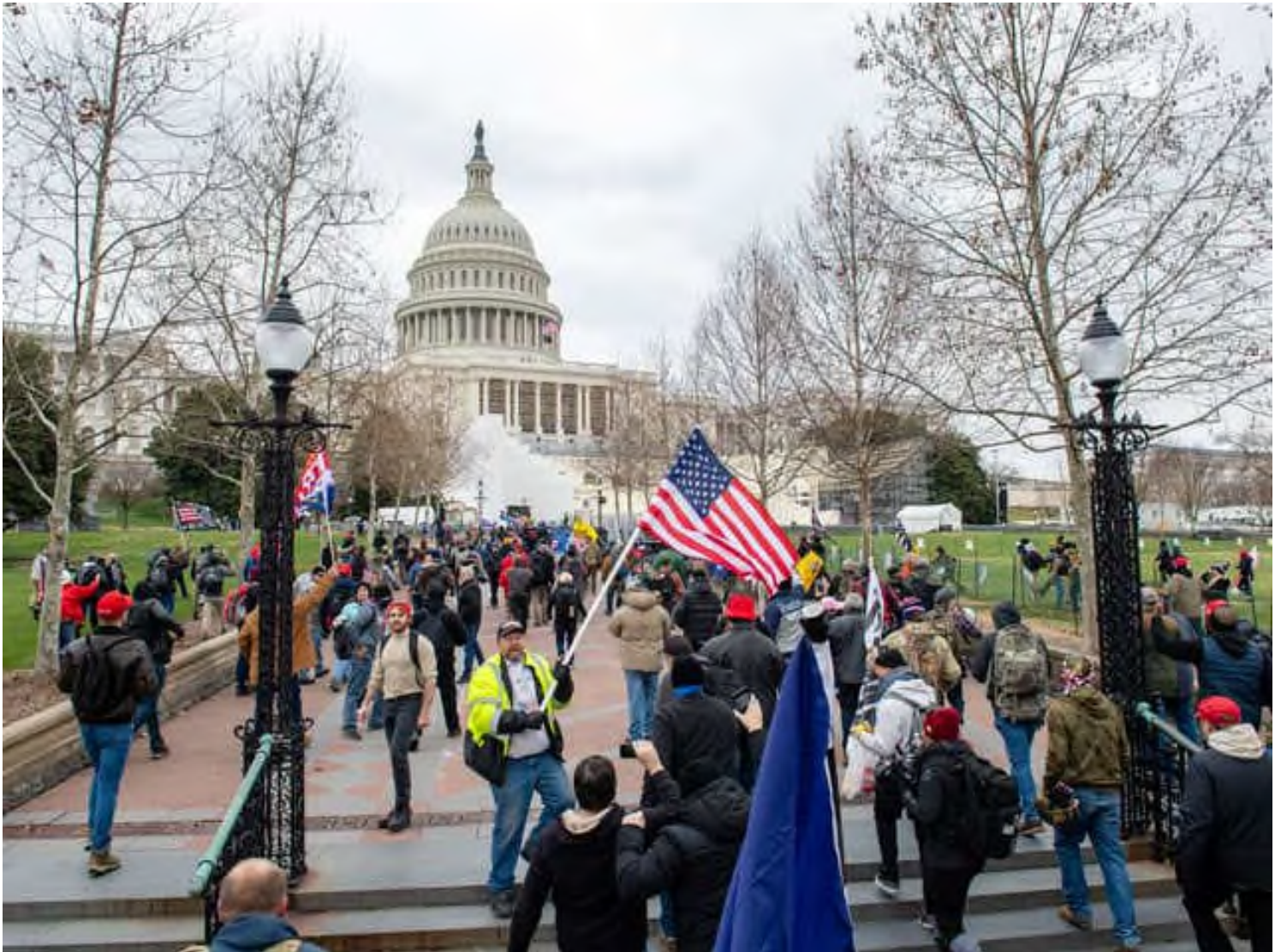
Trump supporters march along a walkway and jump over mesh barricades on the U.S. Capitol lawn.