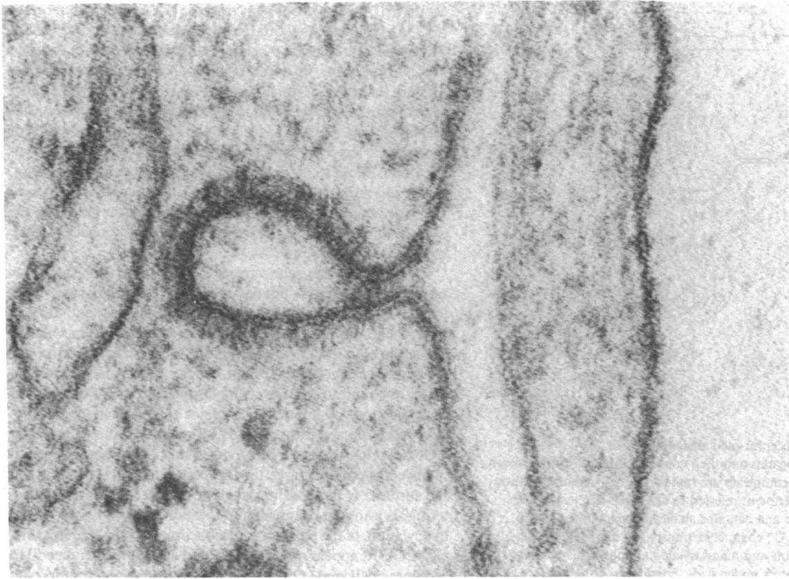
Figure 1. Transmission electron micrograph of hepatic parenchymal cell demonstrating coated pit. An endothelial cell lies to the right of the hepatic parenchymal cell.