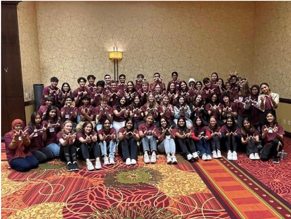
Warren Township High School FBLA members attended the Illinois Fall Retreat.