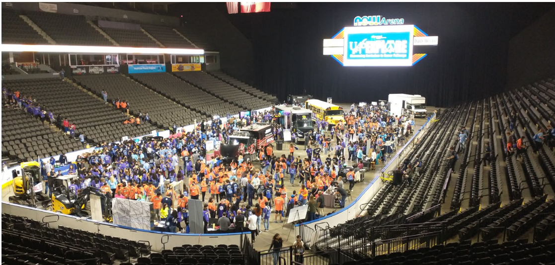
The U-46 Explore Event drew a large crowd to NOW Arena.