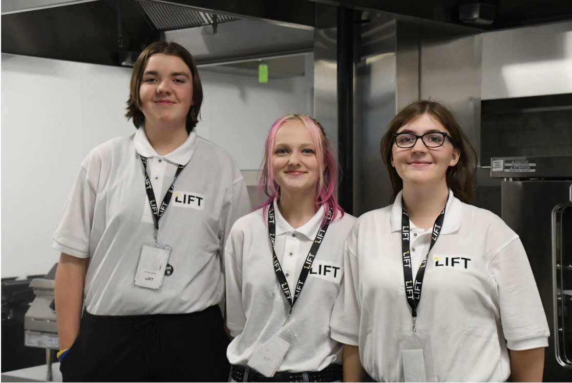
LIFT program students show off work attire.