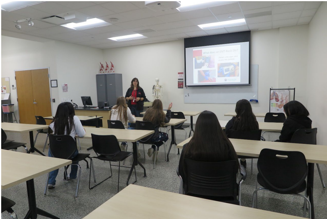
Students learn about EMT requirements.