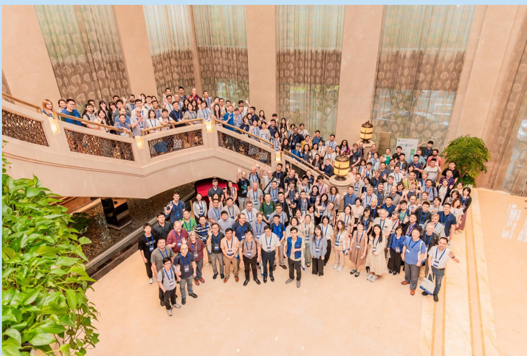
Attendees at the IRS Quadrennial Symposium.

AAS also plans to publish a comprehensive meeting report of IRS 2024 and a special issue featuring select papers presented at the symposium.