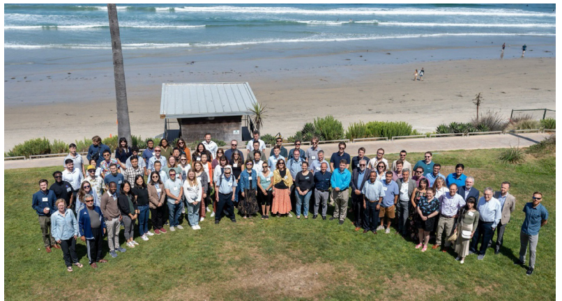
Participants at the 5th International Atmospheric Rivers Conference.