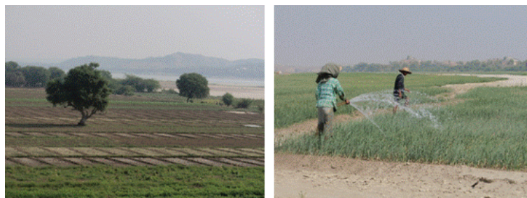
Figure 2. Left panel: example of Kaing farming (farmlands which appear in the flood plain in the Ayeyarwady River) in Magway district (Chauk). Right panel: example of Kyun farming (farmlands which appear on sandbars in the Ayeyarwady River) in Pakkoku township.

Palaeoclimate research in Myanmar is very scarce, although findings about past monsoon variabilities in this region would definitely contribute to a deeper understanding of this atmospheric circulation. There are teak tree ring chronologies covering the last 3 centuries in Myanmar (D'Arrigo et al., 2011; D'Arrigo and Ummenhofer, 2015). Following these studies, the tree-ring records show monsoon rainfall variabilities consistent with results from surrounding countries, indicating that Myanmar is influenced by the same atmospheric circulation system. Sen Roy and Kaur (2000) noted that even though India and Myanmar are geographical neighbours and are influenced by the same monsoon system, Myanmar's rainfall seems to have no significant relationship with the rainfall of northern India. This pattern might be due to the fact that the Rakhine Mountains (< 3800 m a.s.l.) located in the western part of Myanmar (Fig. 1) redirect the wind flows. In contrast, D'Arrigo et al. (2011) detected a positive correlation of monsoon variability in Myanmar with the monsoon larger-scale indices over northeastern India based on teak tree-ring chronology for the last 3 centuries. These contrary findings highlight the urgent need for more climate research in Myanmar.