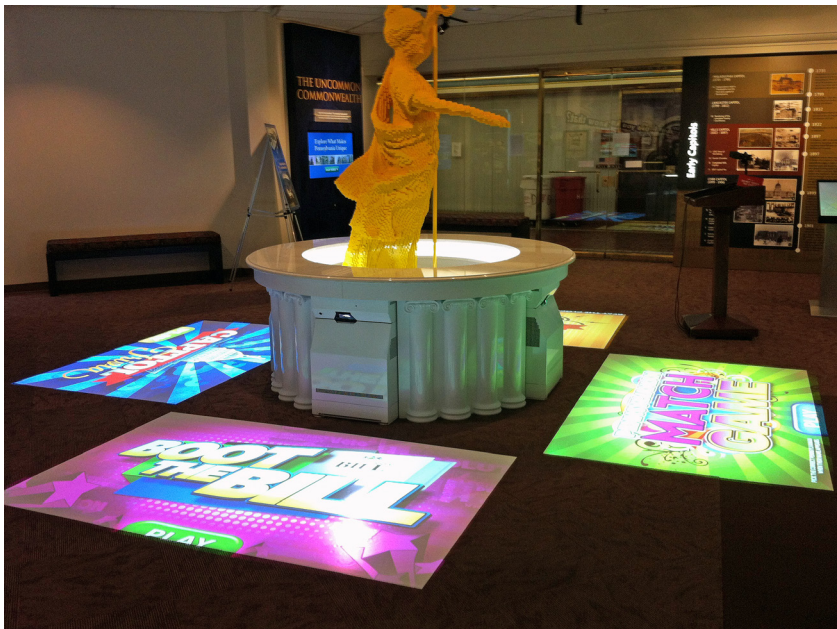
Four CUBEv5's cleverly embedded into cross sections of Roman columns at Pennsylvania Capitol Centre deliver "wow" effect.

- Wired USB keyboard/mouse - Wireless keyboard/mouse set (with USB Receiver available)