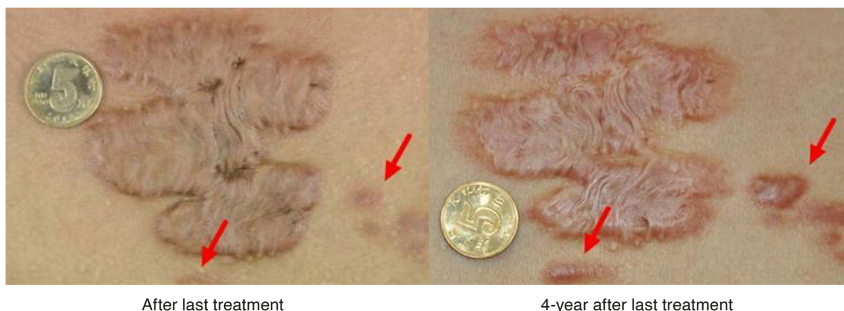
Figure 2. Last follow-up was 4 years after the last treatment. The color of the keloid became even lighter, and the height of the keloid continued to decrease. The border of the keloid became shallower and smoother. Untreated lesion (red arrow) next to the big one enlarged gradually during the four years, with obvious red and pruritus.

evidence for recurrence. While subjective complaints remained the same, objective parameters kept on improving. The color of the keloid became even lighter, and the height of the keloid continued to decrease. The border of the keloid became shallower and smoother. The hardness of the keloid continued to decrease from 11 HA to 5 HA, with a significant improvement in keloid pliability. The length of the keloid remained the same, but the width of the keloid continued to increase from 6.60 cm to 7.12 cm. More importantly, we noticed a small untreated lesion next to the big one, enlarged gradually in time, with red and pruritus (Figure 2).