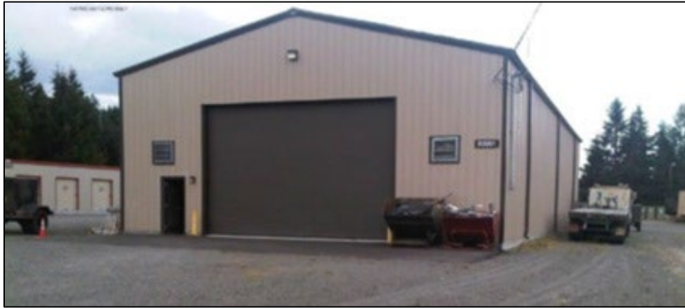
Figure 10. Building

b. Figure 11 is not a relocatable facility as it is permanently affixed to the land.