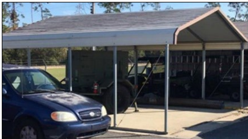
Figure 9. Movable Covered Shelter

h. Figure 9 is a movable covered shelter used as a relocatable facility. It is a relocatable facility if it is not permanently affixed to the land and it is readily erected, disassembled, transported, and re-used.