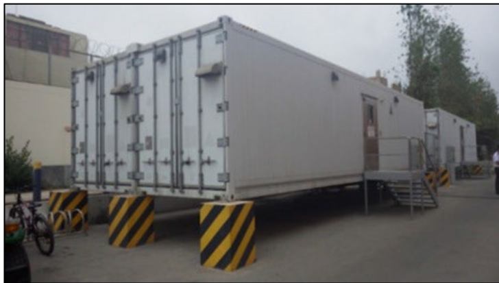
Figure 7. CONEX/ISO Boxes 2

f. Figure 7 is of CONEX/ISO boxes used as a relocatable facility. It is a relocatable facility if it is not permanently affixed to the land and it is readily erected, disassembled, transported, and re-used.