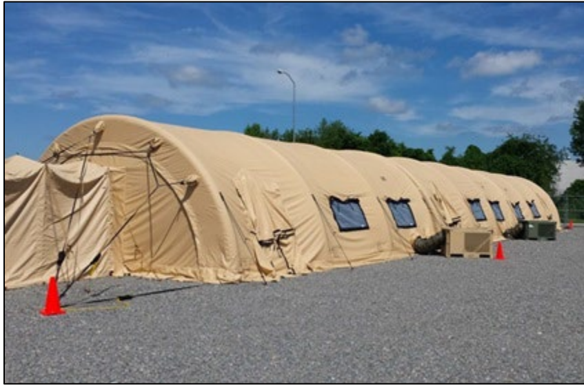
Figure 12. Tactical Equipment

d. Figure 13 is not a relocatable facility as it is constructed as part of a military vehicle.