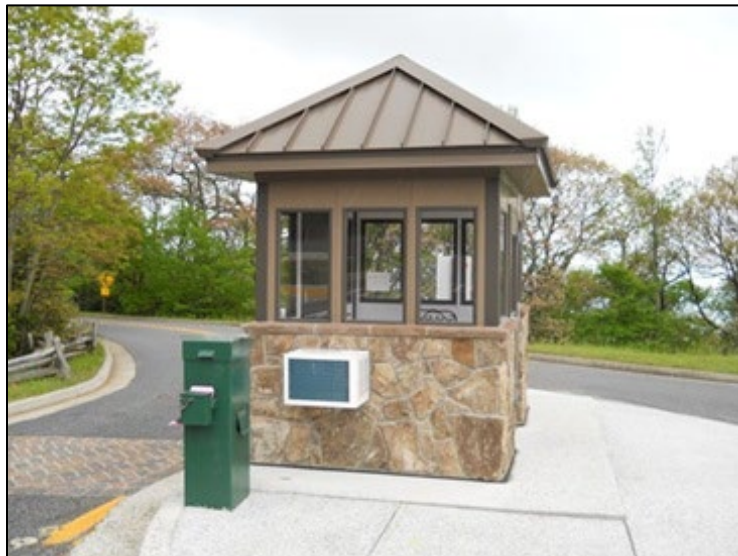
Figure 11. Guard Shack

b. Figure 11 is not a relocatable facility as it is permanently affixed to the land.