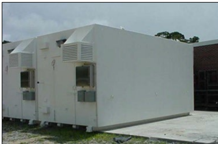
Figure 5. Shed on Skids

d. Figure 5 is of a shed on skids used as a relocatable facility.