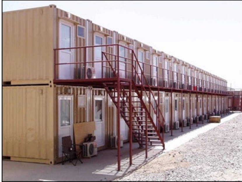
Figure 6. CONEX/ISO Boxes 1

f. Figure 7 is of CONEX/ISO boxes used as a relocatable facility. It is a relocatable facility if it is not permanently affixed to the land and it is readily erected, disassembled, transported, and re-used.