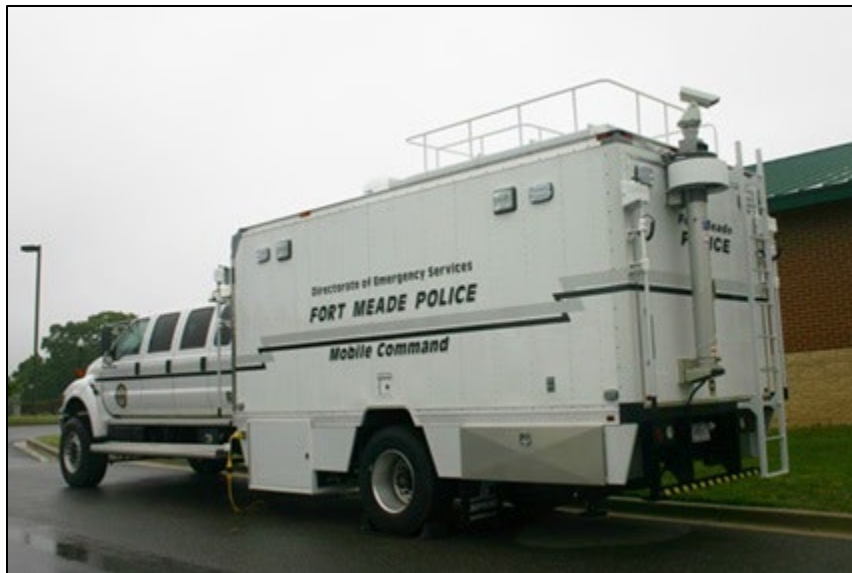
Figure 13. Mobile Military Equipment

d. Figure 13 is not a relocatable facility as it is constructed as part of a military vehicle.