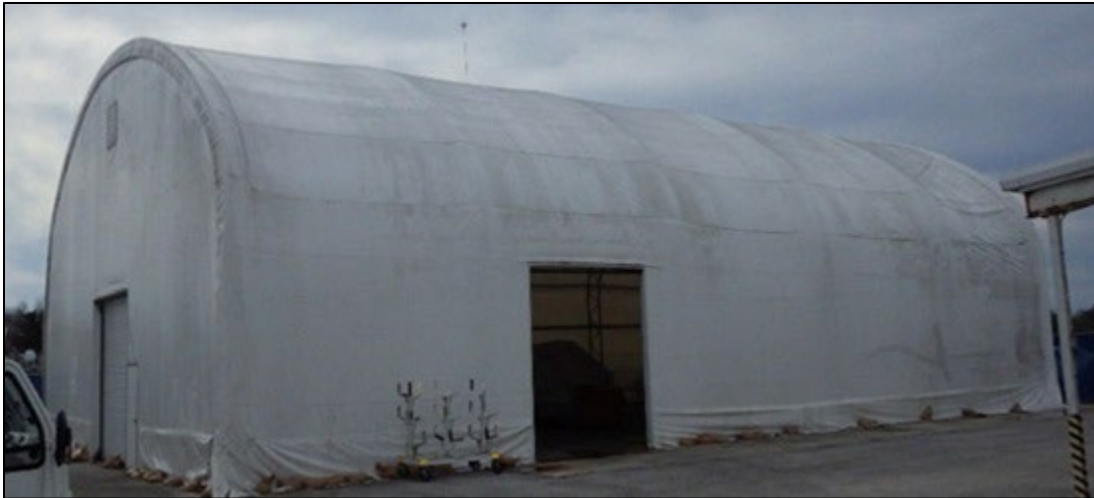
Figure 4. Tension Fabric Structure 2

d. Figure 5 is of a shed on skids used as a relocatable facility.