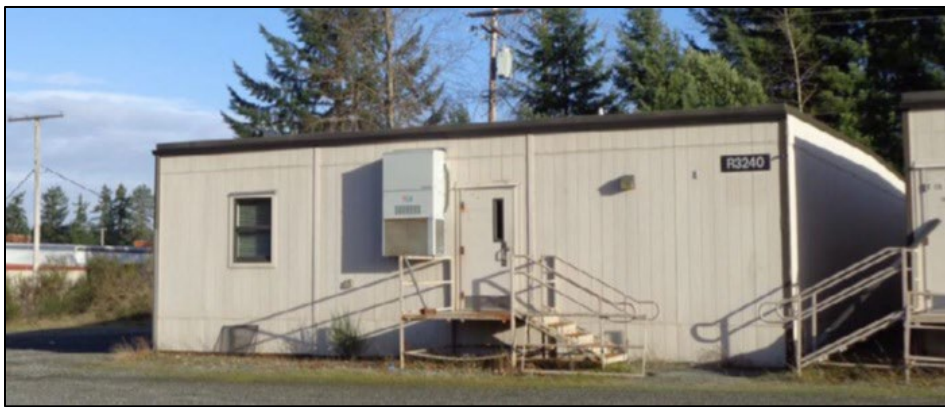
Figure 2. Trailer Facility

b. Figure 3 is of a tension fabric structure used as a relocatable facility. It is a relocatable facility if it is not permanently affixed to the land and it is readily erected, disassembled.