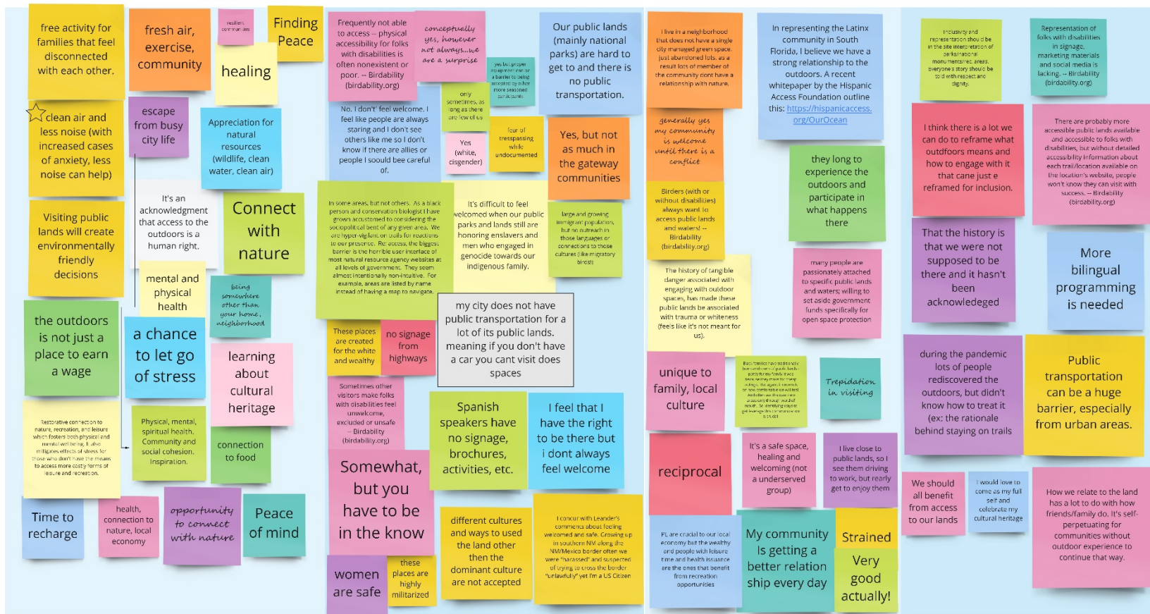
Figure 1: Perceptions Miro Board Screenshot