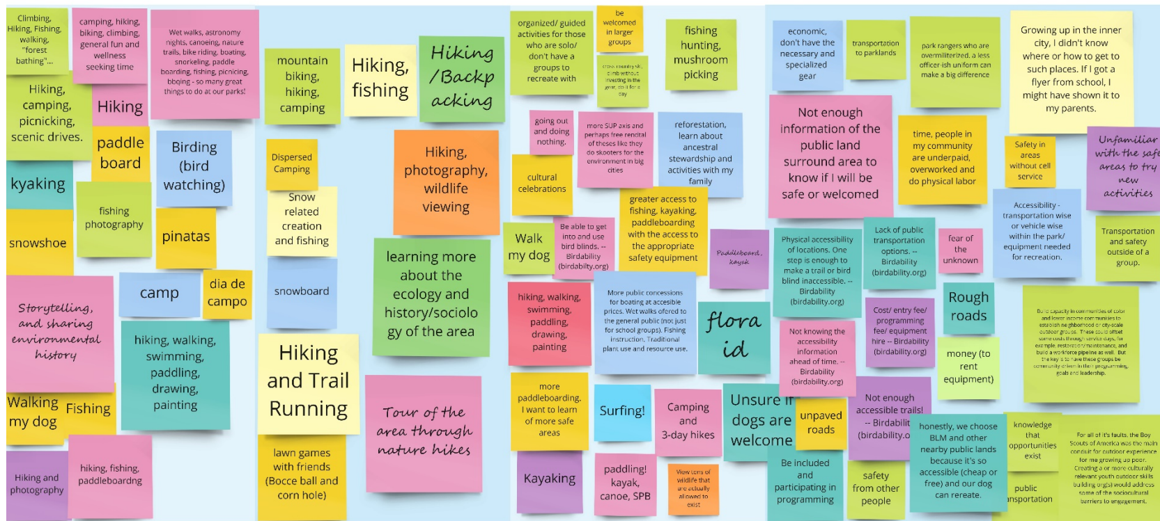
Figure 3: Barriers Miro Board Screenshot