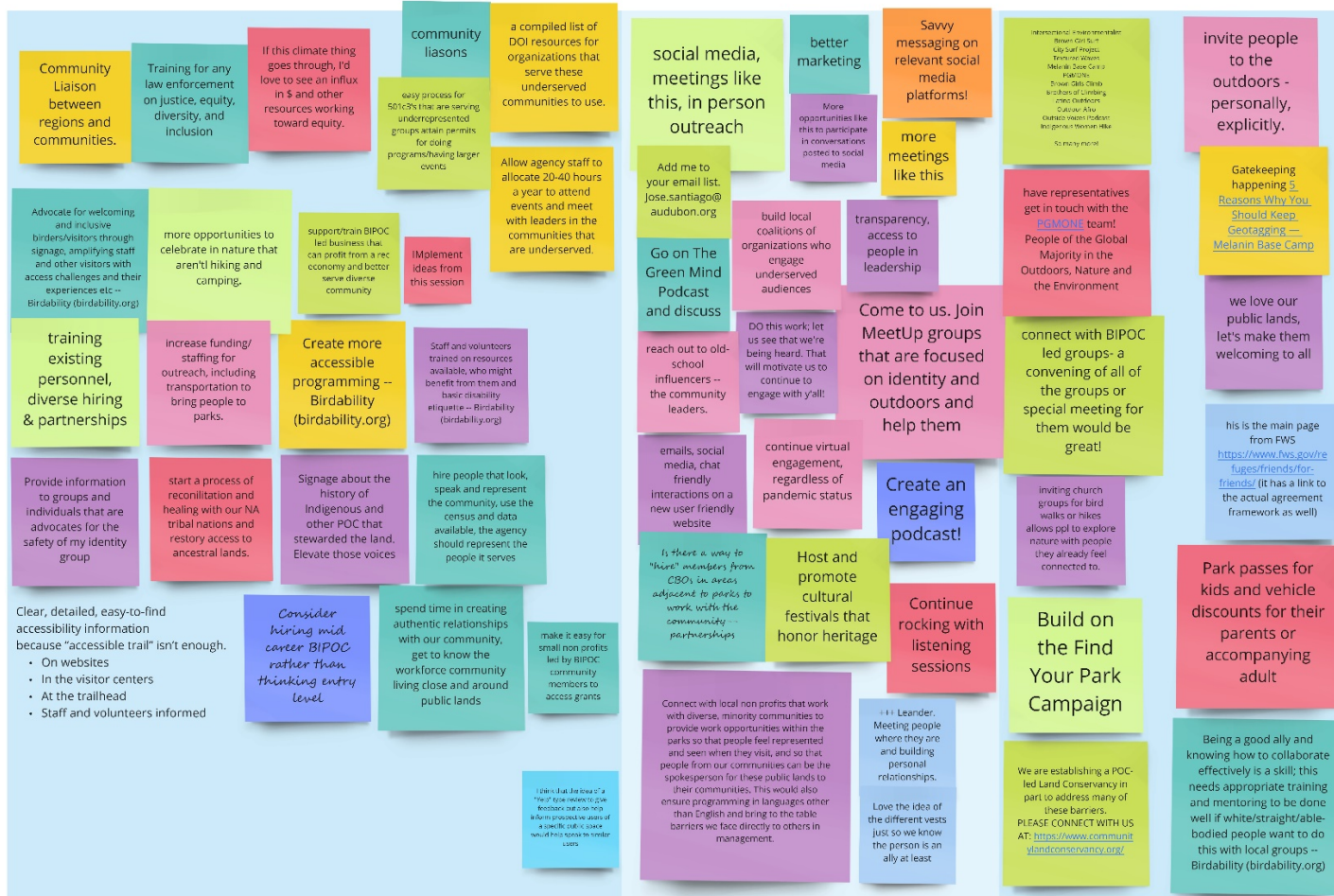
Figure 4: Recommendations Miro Board Screenshot