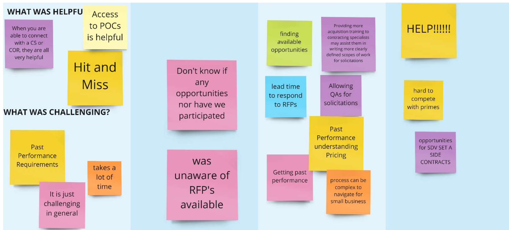
Figure 2: What is working now? What could be working? Miro Board Screenshot