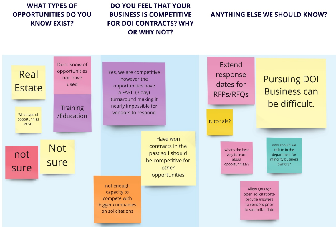
Figure 1: Perceptions Miro Board Screenshot

This Appendix features participant responses to the DOI Listening Session on Contracts for Businesses with Characteristics that Align with the Definition of Underserved Community on October 25, 2021, from 8:00 pm - 10:00 pm ET. The sticky notes included on the board reflect participants' own words, experiences, reflections, and recommendations.