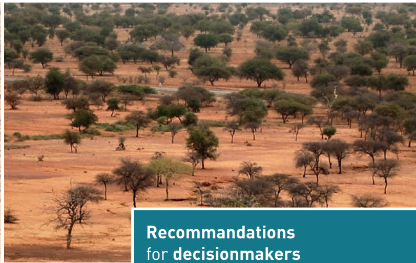
Sahelian landscape

projects include the Algerian Green Dam project which, as indicated in published reports and findings, met with some success but also quite a few failures, resulting in major project changes. The Great Green Wall of China has not been designed as a dam but instead it is a gigantic integrated management project to combat desertification in an area of over 4000 km long and 1000 km wide. This involves a combination of forest and shrub plantations, grassy vegetation cover in farming systems.