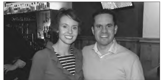
After taking a "Pontoon Porch" boat ride on Friday members of the Class of 1993 gathered at Sardine Bar and Restaurant on Lake Monona. On Saturday they met again for a cocktail reception and dinner at Sprecher Restaurant.