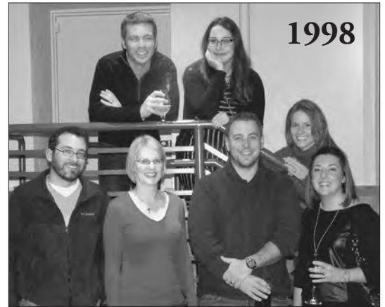
Reunion attendees from the Class of 1998 enjoyed drinks and conversation as they caught up on the past 15 years.