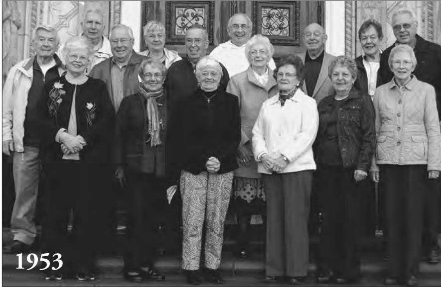
Class of 1953 members who attended the Sunday morning Mass in EHS Chapel. The Mass, followed by a breakfast, concluded a weekend reunion that included a casual gathering on Friday evening and a Saturday evening social and dinner.

Share your reunion plans and photos (and a brief description or ID of the people in the picture) with the Edgewood Alumni Office so we can help promote your events and share images of classmates with those who could not attend!