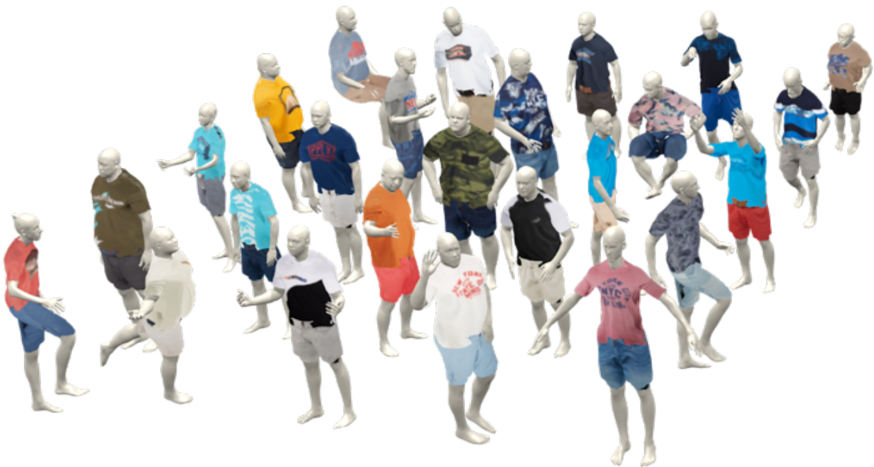
Figure 4. Once textures are mapped to their corresponding texture maps, they can be rendered atop SMPL in different shapes and poses