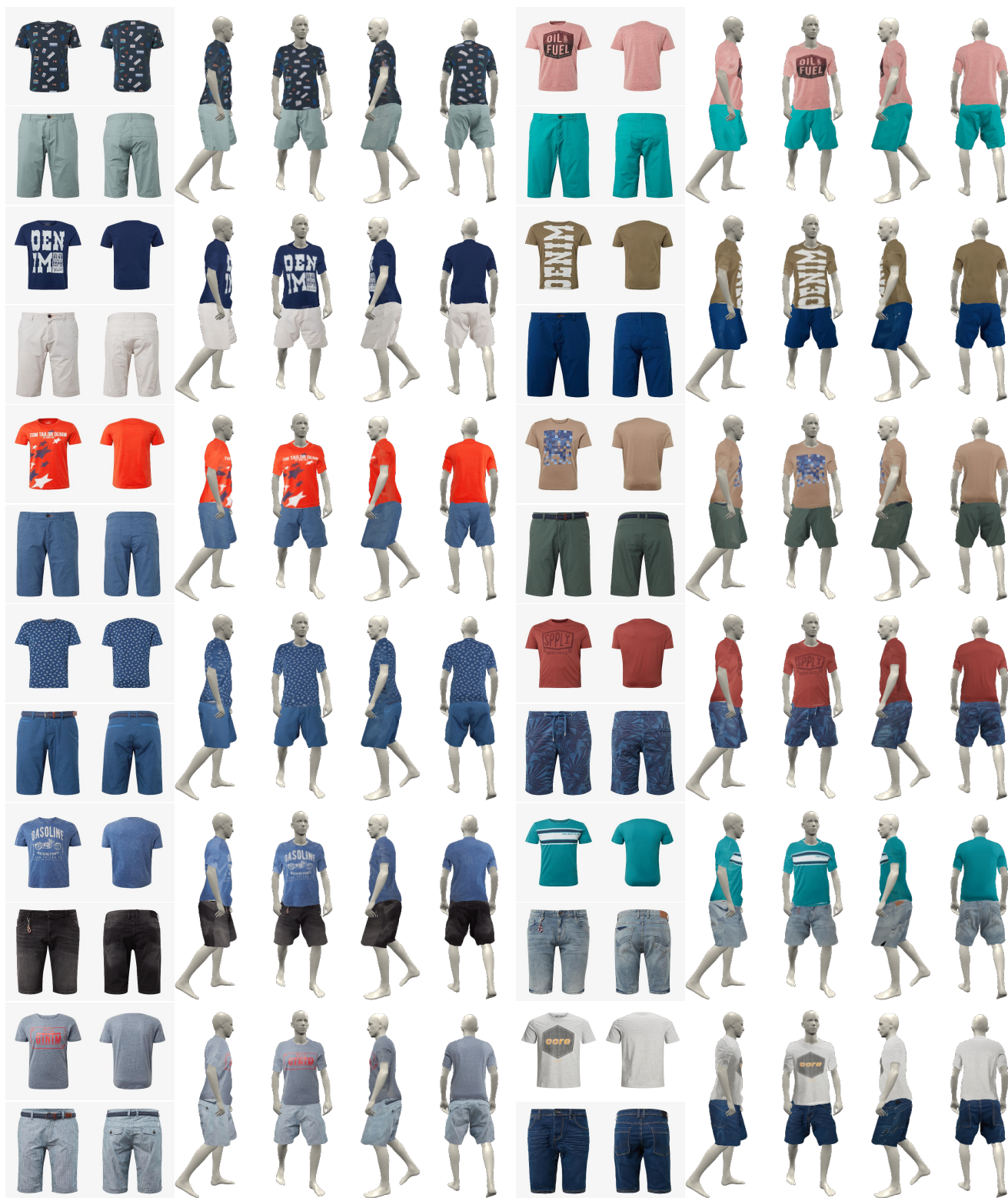
Figure 3. Textures mapped by Pix2Surf rendered atop SMPL