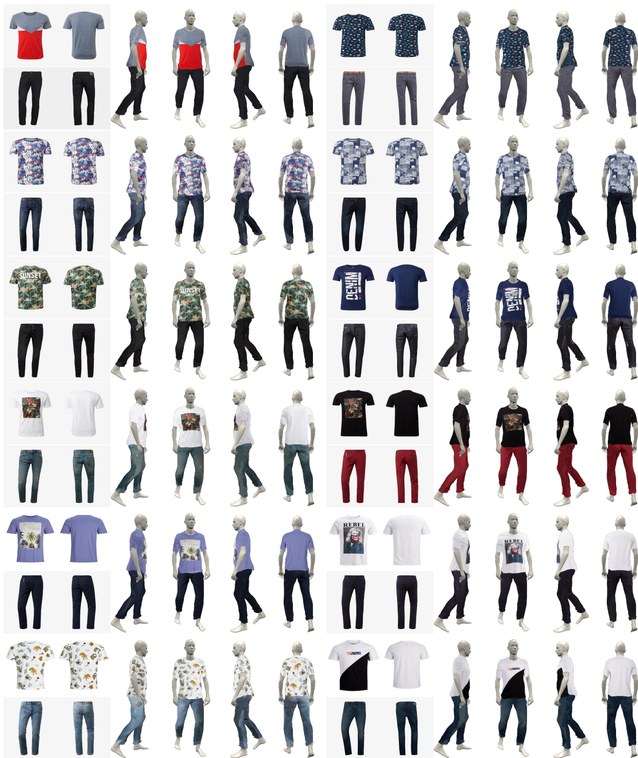
Figure 2. Textures mapped by Pix2Surf rendered atop SMPL