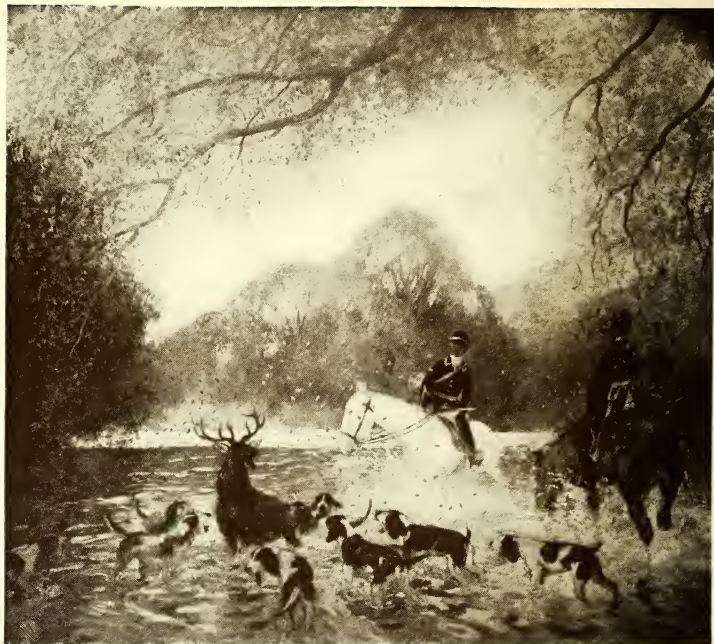
GASTON LA TOUCHE