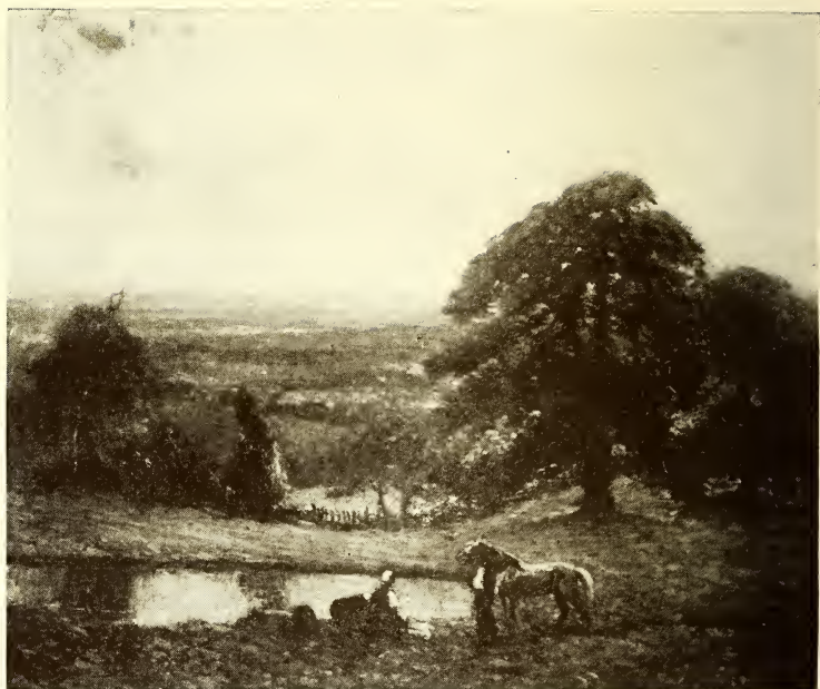
FERNAND MAILLAUD 180 AUTUMN LANDSCAPE, VALLÉE NOIRE