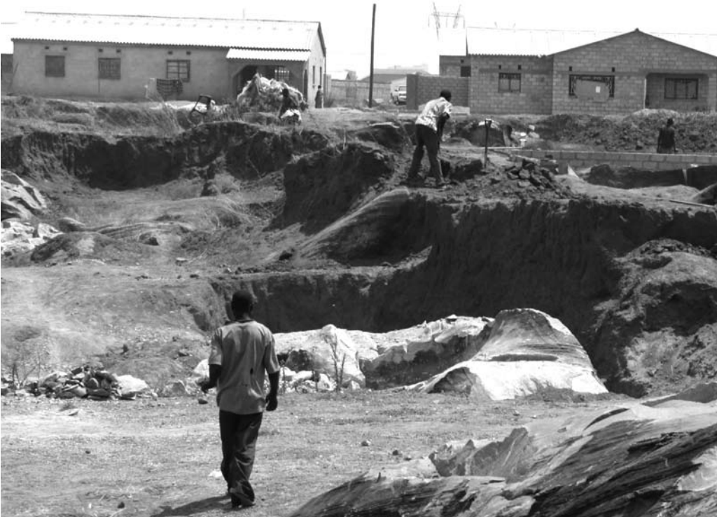
Kitwe: environmental damage.

In Lusaka, community profiles were undertaken in the three settlements of Chibolya, Chinika and Mandevu/Marapodi. The profiles asked communities to identify their needs, prioritise them and formulate programmes to address them. In turn, these profiles provided baseline information on the socio-economic status of these settlements. The community profiles were undertaken in conjunction with the Research Unit of the Lusaka City Council, which resulted in the transfer of job skills to council staff. Execution of this activity marked the beginning of the basic level of environmental planning and management implementation involving the community and the council. A consolidated report of the settlements' profiles was produced and provided reference material for community consultations. The report was also extensively used as reference material by the Sustainable Lusaka Programme for subsequent interventions, and by other development actors that initiated interventions in other peri-urban settlements, for example the Japan International Cooperation Agency Study Team, in their study on Environmental Planning in Unplanned Urban Settlements.