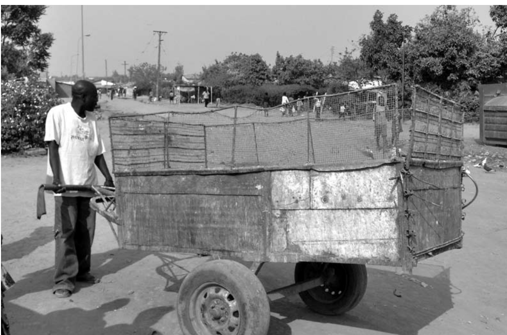
Lusaka: waste transportation.

The project had its challenges: (i) many people in the settlements were either too old or too poor to pay for services, making it difficult any business enterprises to survive (ii) failure by Lusaka City Council to provide transportation of solid waste to midden heaps and secondary transfer stations to the dumpsite (in support of