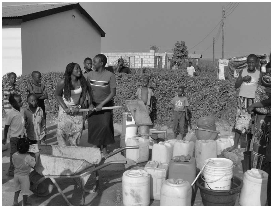
Lusaka: water demonstration project.