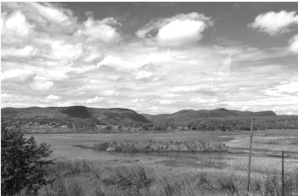
Kafue river, Kitwe.

None of the Sustainable Cities Programme cities have held follow-up consultations since the initial process began, thereby denying stakeholders feedback on any progress made in addressing environmental issues and any emerging ones.