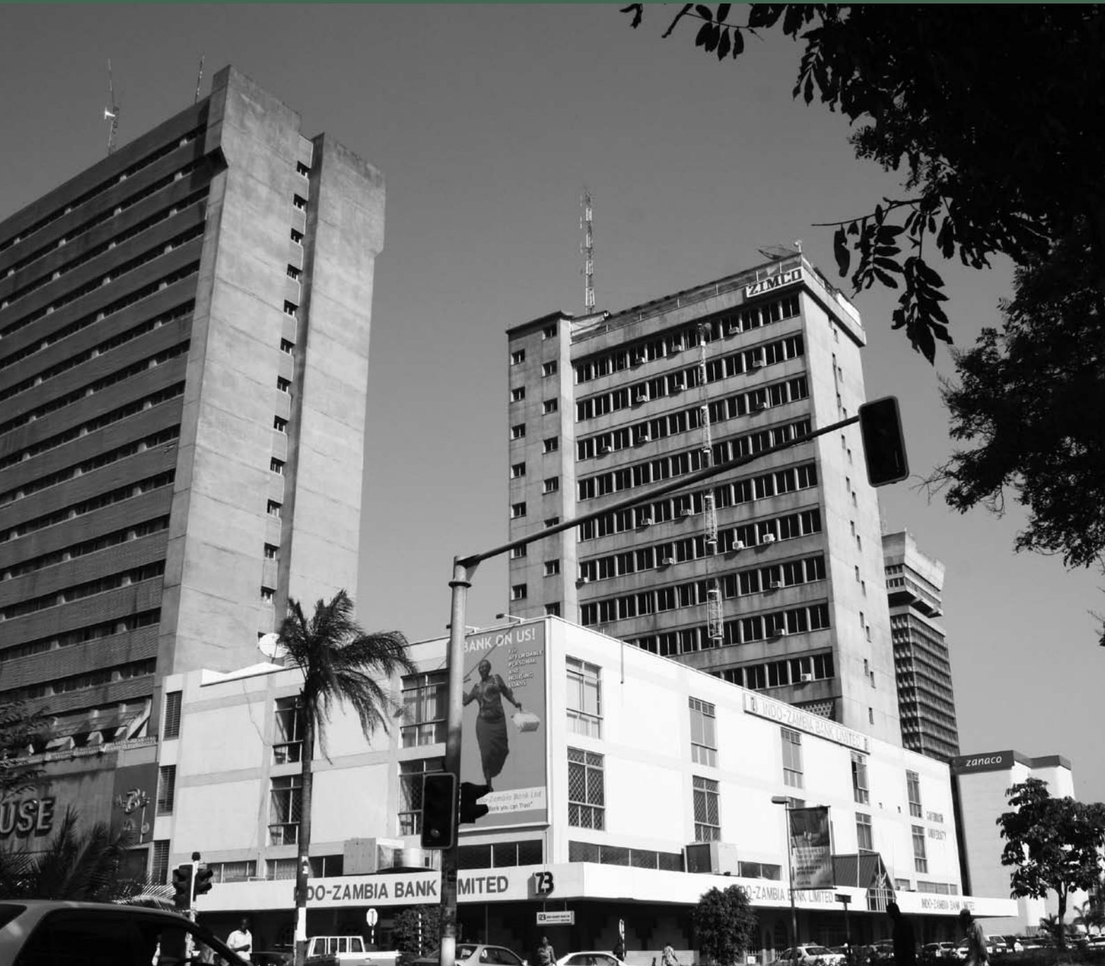
Lusaka Central Busines District.