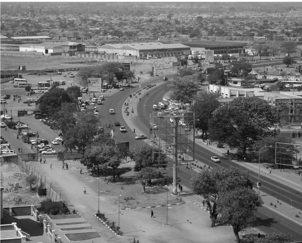
Aerial view of Lusaka.

population of about two million people, which represents about 17% of the country's total population. This rapid population growth is driven by a number of factors, among them, a rural-urban and intra-urban/city migration in search of a better life. This was exacerbated by the overall economic malaise that began to affect other towns on the copper belt after the closure of most of the mines and the collapse of auxiliary industries supporting those mines. In turn, this led to Lusaka becoming one of the most urbanised cities in the southern Africa sub-region. This has initiated increased urbanisation with its attendant effects of overcrowding and congestion, insufficiently serviced housing areas, rapid economic decline, urban poverty, unplanned settlements, and poor living conditions. As more than 60% of the population lives in peri-urban settlements, some of which are considered illegal, the Lusaka City Council was not obliged to provide services. This caused perennial outbreaks of waterborne diseases like cholera. The major environmental challenges of concern in Lusaka have included (i) Air and water pollution (ii) Insufficient water resources (iii) Ineffective solid waste management (iv) Undeveloped waterborne sanitation systems (iv) Traffic congestion (v) Limited urban planning capacities (vii) Open quarrying.