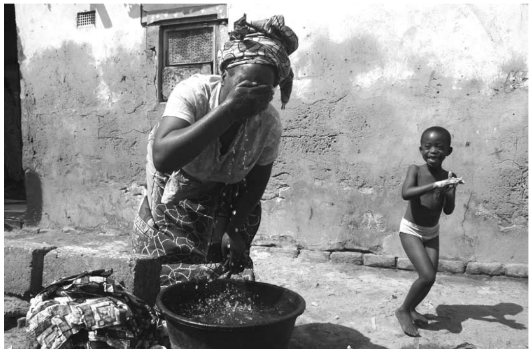
Lusaka: inadequate domestic water.