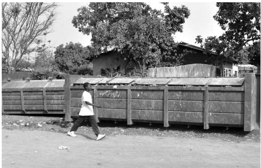
Lusaka: waste collection bins.