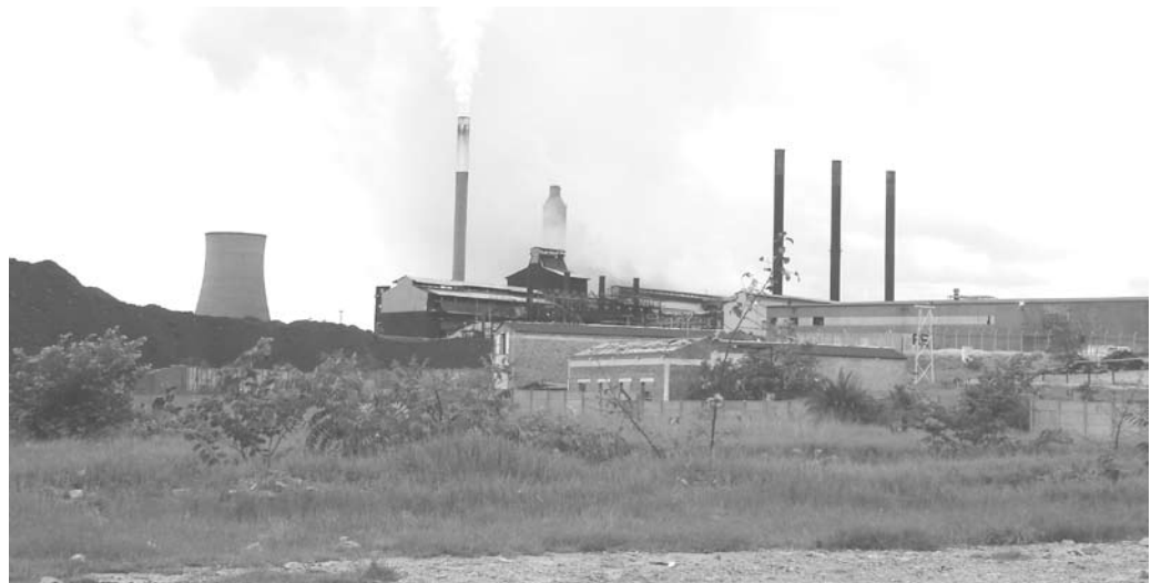
Mine pollution.