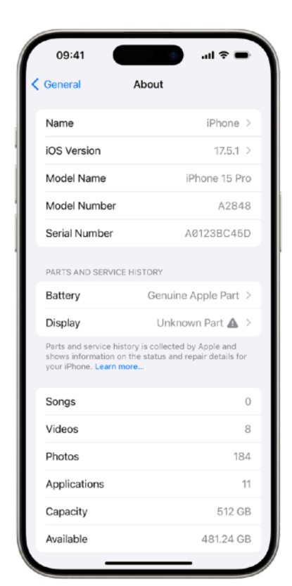
A Parts and Service History section in iPhone settings will appear if a user's iPhone has undergone repair.