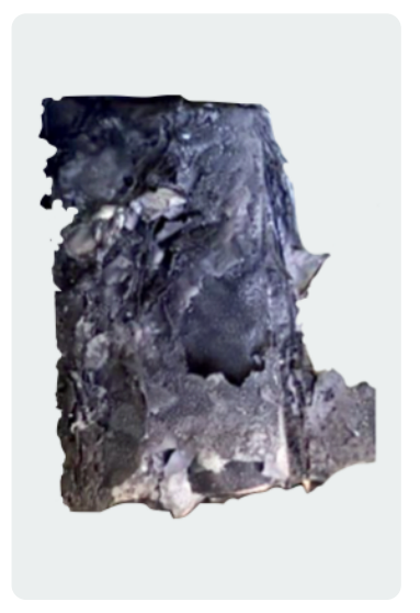
Third-party battery after an Abusive Overcharge test, which is intended to simulate charging the battery beyond its intended limits.