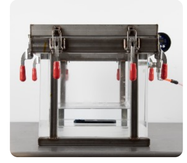
To test for IPX7/8 water immersion protection, Apple submerge iPhone inside a pressurised vessel to simulate pressure experienced underwater.