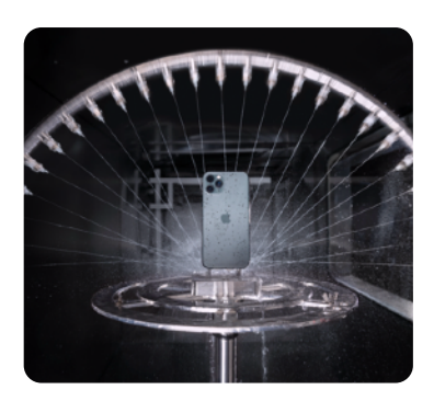
To test for IPX3/4 water resistance, Apple use a swing arm with nozzles to simulate water spraying or splashing on iPhone.

For example, early generations<sup>6</sup> of iPhone were susceptible to failure if exposed to liquids, such as accidental spills, getting caught in the rain or drops in water – so our design teams iterated until they were able to achieve robust liquid ingress protection, which decreased repair rates by 75% with iPhone 7 and iPhone 7 Plus. While these changes required the addition of adhesives, seals and gaskets that made repairs more complex, the remarkable improvements to product longevity justified a slight increase in repair complexity. The reliability of our hardware will always be our top concern when seeking to maximise the lifespan of products. The reason is simple: the best repair is the one that's never needed.