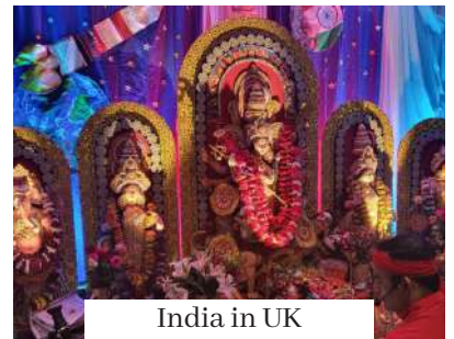
India in UK