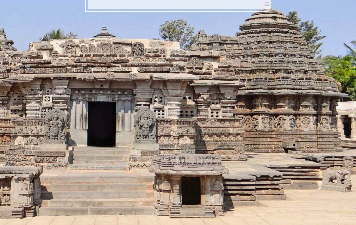
Hoysala-style Temple complexes constructed between the 12th & 13th centuries, Karnataka inscribed in the UNESCO World Heritage List as Bharat's 42nd entry