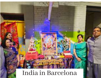
India in Barcelona