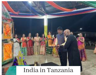
India in Tanzania