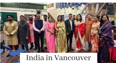
India in Vancouver