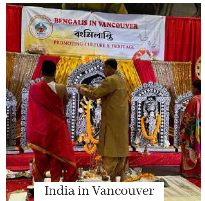
India in Vancouver