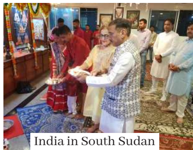
India in South Sudan