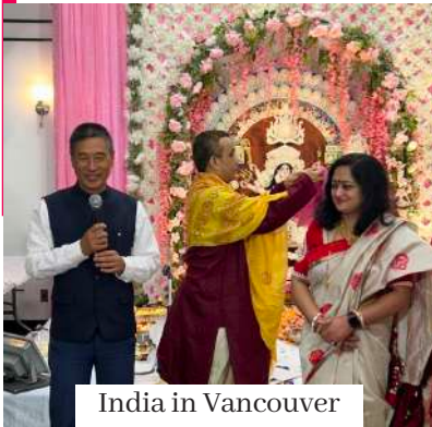
India in Vancouver

Members of the Indian diaspora celebrated Navratri and Durga Puja around the globe, showcasing the rich diversity of Indian culture. These vibrant festivals highlight the deep appreciation for tradition and community, uniting people through shared heritage and festivities.