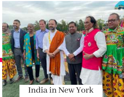
India in New York