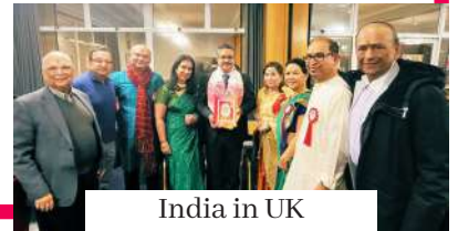
India in UK