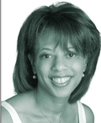
Melody Barnes , chair of the Aspen Institute Forum for Community Solutions