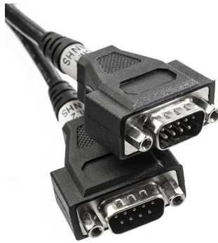
Figure 3: CAN connectors on Kvaser USBcan R v2 2xHS

The Kvaser USBcan R v2 has two CAN Hi-Speed channels with 9-pin D-SUB CAN connectors (see Figure 3 on Page 8). See Section 4.2, CAN connectors, on Page 10 for pinout information.