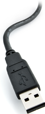
Figure 2: A standard USB type "A" connector.

The Kvaser USBcan R v2 has a standard USB type "A" connector.