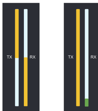
Figure 7: The total size of the LED Bars is proportional to the bus load. Both images indicate a bus load of 100%.

Page 12 shows two different bus load conditions. The image on the left shows the unit transmitting and receiving data corresponding to 50% bus load in each direction for a total of 100% bus load. The image on the right shows the unit transmitting data corresponding to 100% bus load.