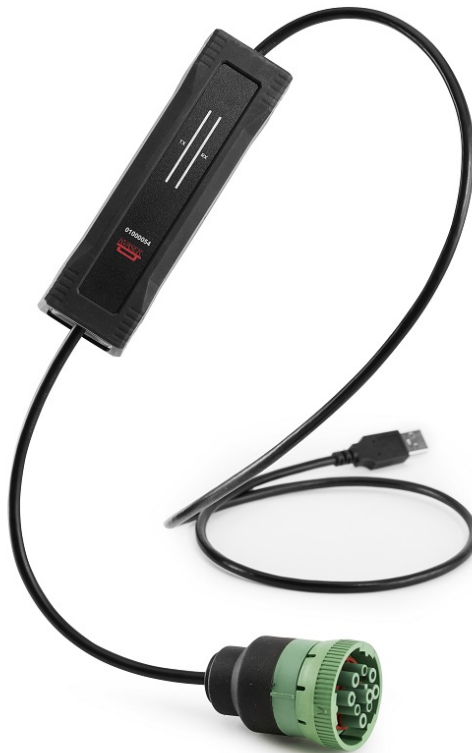
Figure 1: Kvaser U100-X1

Kvaser U100-X1 is a small, yet powerful, CAN to USB interface. It provides real-time transmission and reception of standard and extended CAN messages on the bus with a high timestamp precision, and is compatible with applications that use Kvaser's CANlib.