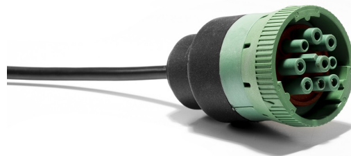
Figure 3: J1939-13 Type II CAN connector.

The CAN connector for the Kvaser U100-X1 is the 9-pin J1939-13 Type II connector (see Figure 3) which has the pinning described in Table 2 on Page 9.