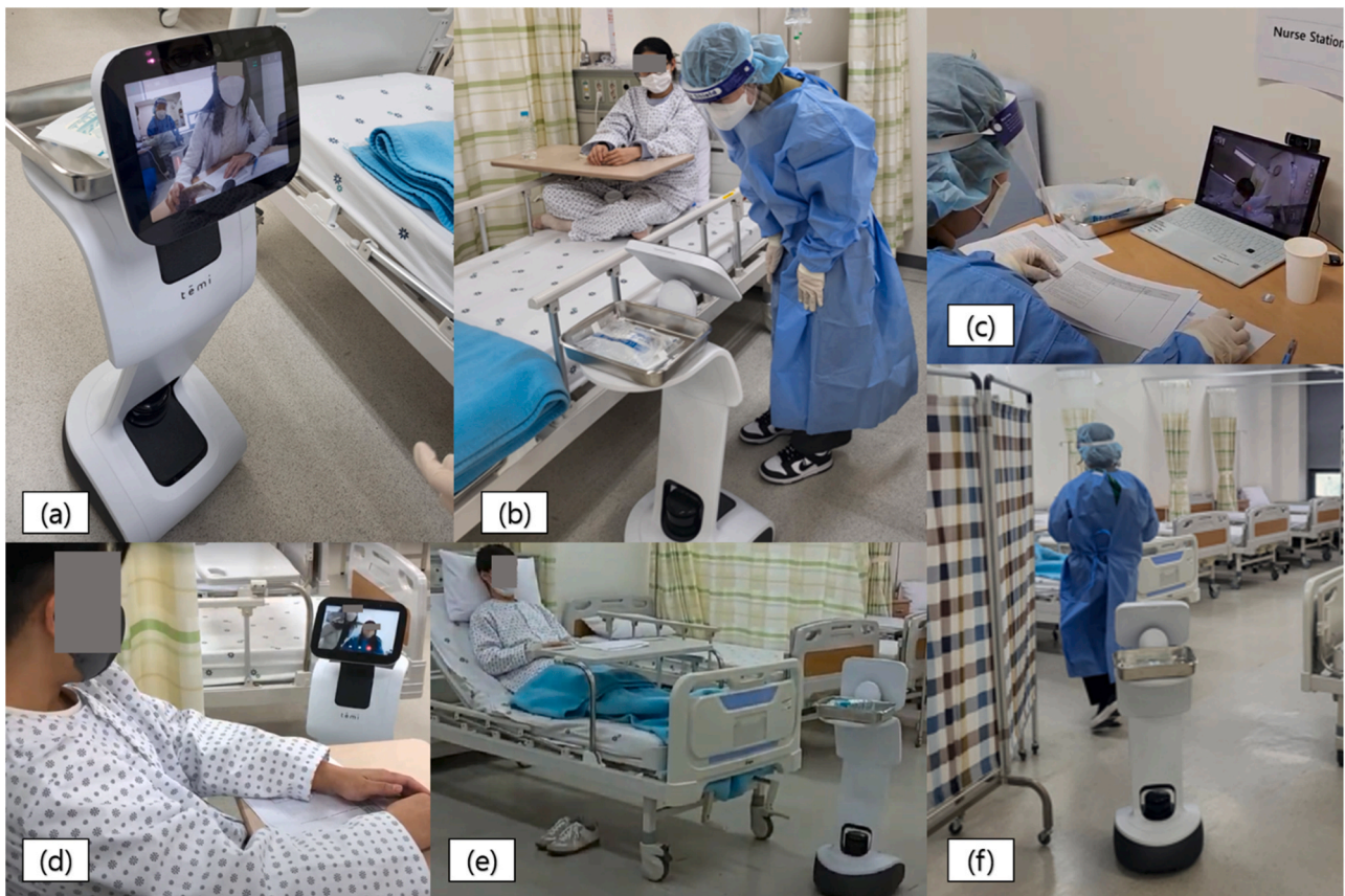
Fig. 3. Simulation setting and mobile robot: (a) Medical staff outside the isolation room displayed on the robot screen, (b) Communication between the isolation room and the outside through the robot, (c) Remote consultation from outside the isolation room, (d) Video calls between the patient and the outside of the isolation room, (e) Robot delivering medication along mapped paths, (f) Robot autonomously tracking medical staff without physical contact.