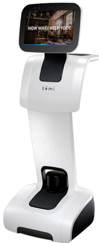
Fig. 1. Mobile robot used in the study.

12 patients. As a standard practice, one nurse was assigned to three rooms in a four-bed setup. According to a previous study, on average, the frequency of room visits was approximately 6 times per room, resulting in a total of 18 entries and exits for the three rooms [20]. The scenario in this study assumed that a nurse inside the isolation room would care for the patient while communicating with a nurse at the station.