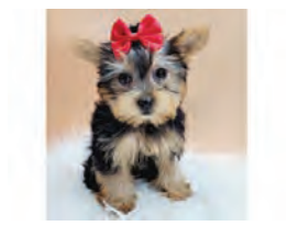
YORKIE PUPPIES ADORABLE, pure bred, toy & teacup sizes. Call 718-306-4136