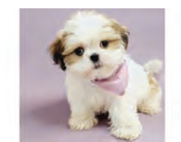
SHIH-TZU PUPPIES Beautiful Males & Females Price to Sell Call 718-306-4136