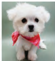
MALTESE PUPPIES Adorable males and females, toy or teacup sizes, shots and papers. Call 718-306-4136