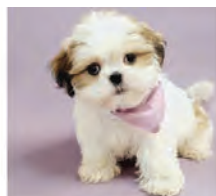
SHIH-TZU PUPPIES Beautiful Males & Females Price to Sell Call 718-306-4136