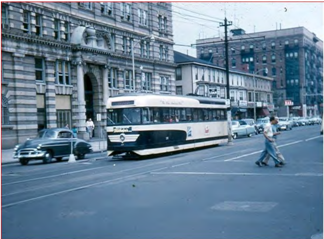
Figure 2: Margate-bound Brilliner on Atlantic Avenue, looking east of South Carolina Avenue, 1954

Atlantic Avenue and Pacific Avenue from Boston Avenue to the west, and Maryland Avenue to the east, formed the commercial and entertainment corridors of the City. The cluster of retail, entertainment, and service industries thrived from the local and tourist populations that patronized the concentration of establishments along these corridors. The businesses were primarily small and medium sized enterprises that provided a variety of marketable goods and services to the public. The decade-long boom of the hotel and casino industry had an inadvertent effect on the City's retail service and entertainment industries, in general; and, along the Pacific Avenue and Atlantic Avenue commercial corridors in particular. The loss of consumer patronage (tourists providing a large share of the revenue) resulted in the closing of businesses, increased vacancy and the homogenization of retail and service enterprises. Contributing factors of this decline included the wholesale demolition of commercial properties, creating lower density, single use improvements.