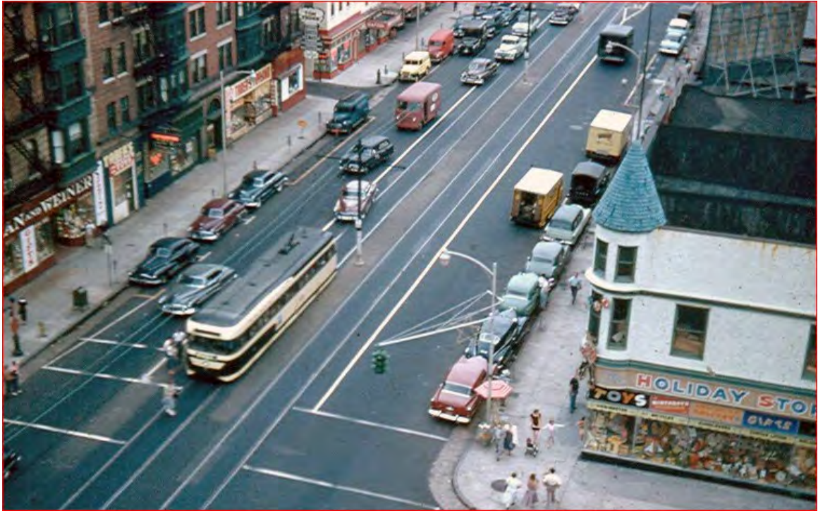
Figure 3: Period photo showing Atlantic Avenue, looking eastbound, 1950s

Central Business District (CBD) and Resort Commercial (RC) Zoning District in the CRDA Tourism District, by permitting the establishment of cannabis retail shops, consumption lounges and facilities for the growth and distribution of recreational cannabis. The plan allows for the two commercial corridors, without the selective identification of any single property or group of properties, in the Green Zone Redevelopment Area to be used as an establishment for any of the permissible classes of recreational cannabis.