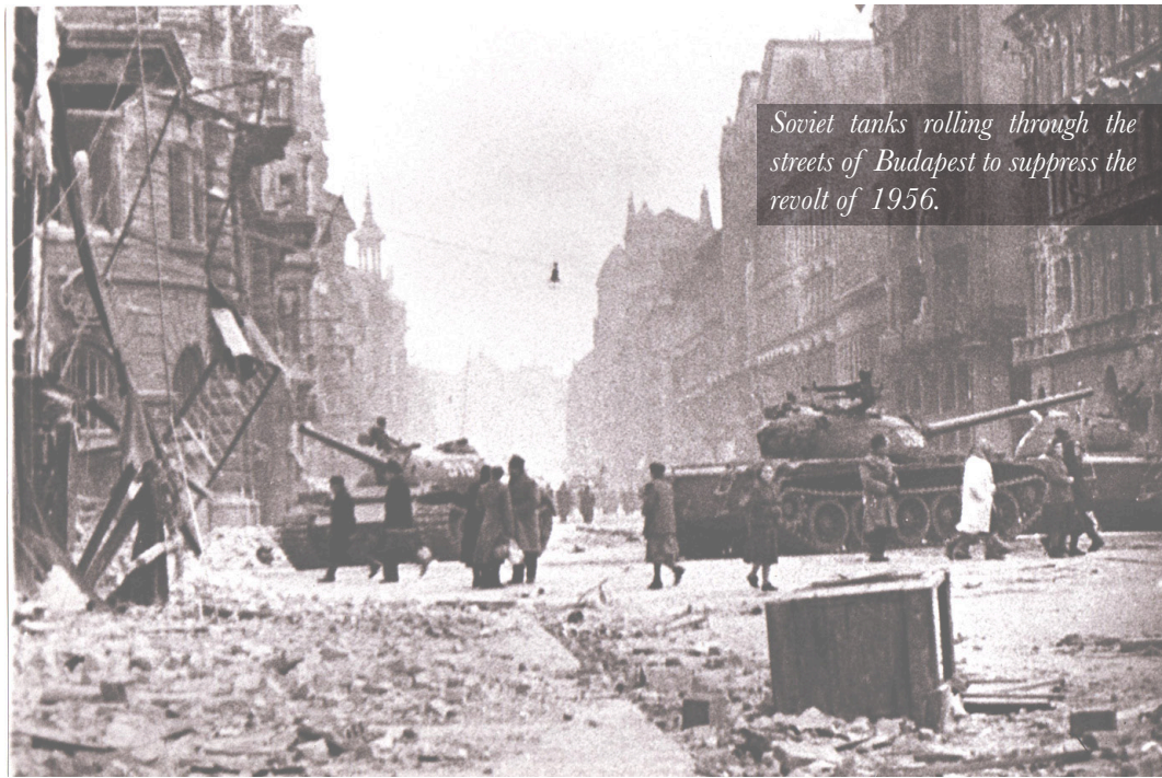
Soviet tanks rolling through the streets of Budapest to suppress the revolt of 1956.

Some have argued that we should suspend conflicts with proponents of authoritarian communism in order to focus on more immediate threats, such as fascism. Yet