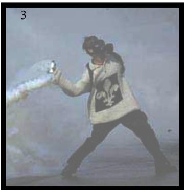
Tear gas canisters can be thrown away from the crowd, but be careful. They are extremely hot, and can burn your hands.

to intimidate and scare people away; Surprise attacks by troops hidden in reserve; Surround and Isolate Entire Crowds – Sometimes not allowing people to leave or enter.