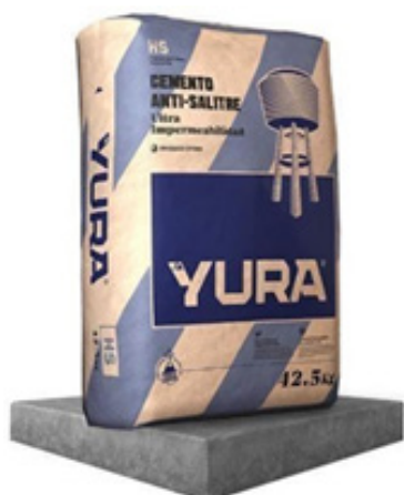
Figure 1 Type HS ultra-waterproof Portland cement.