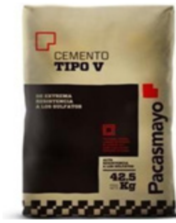
Figure 2 Type V Portland cement.