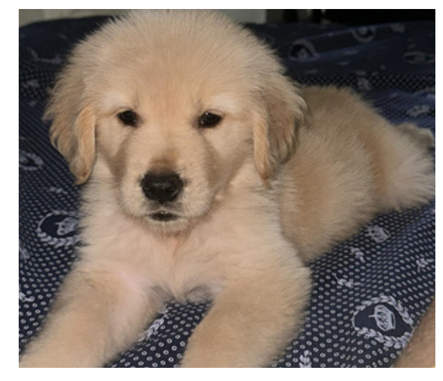
Figure I Clinical appearance of Golden Retriever puppies with renal dysplasia.

clinical examination, the animal showed signs of growth retardation, pale mucous membranes, opaque and dry fur (Figure 1).