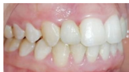
Figure 15 Final result after a two-weeks control.