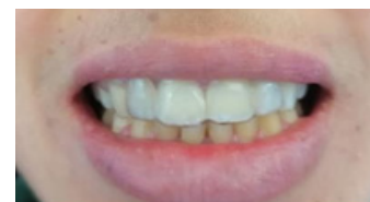
Figure 1 Pre-operative extra-oral view.

A 24-year-old healthy female patient with congenitally missing both upper lateral incisors was referred to the department of fixed prosthodontics in the dental clinic of Monastir. She had recently completed orthodontic treatment that included space opening for eventual dental implants. However, radiographic showed insufficient apical inter dental bone volume which did not allow implant placement. Clinical examination revealed bilateral missing maxillary lateral incisors, short edentulous span, a slight deep bite and bilateral class I molar and canine relationships with canine guidance (Figure 1, 2).