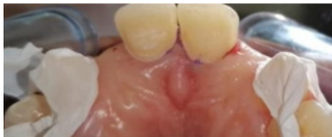
Figure 4 Palatal limits of the preparation.

Palatal preparation is extended to interproximal surfaces to optimize retention. Interproximal preparations adjacent to edentulous sites included interproximal contacts (Figure 5, 6). All line and angles are rounded and prepared for digital impression. A silicone impression was conducted then transferred to dental laboratory. The FPD was manufactured. Prior to cementing, IPS emax RBFDPs were carefully positioned with try-in pastes to verify marginal adaptation, shape, color and occlusion (Figure 7). Internal surfaces of the restorations were conditioned with an 8% hydrofluoric acid for 20 seconds, washed with water and air-dried to be then, silaned (Figure 8, 9). Abutment surfaces of the teeth were etched with a 37% phosphoric acid for 30s then washed and dried (Figure 10, 11). A total etch adhesive system was applied with a 20 s photoactivation. (Figure 12)