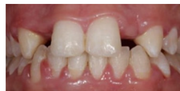
Figure 2 Pre-operative intra-oral view.