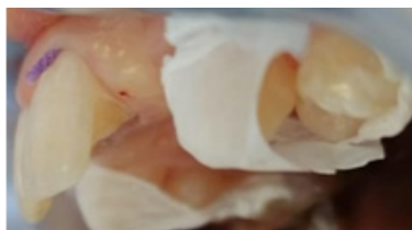
Figure 5 Proximal limits of the preparation.

Palatal preparation is extended to interproximal surfaces to optimize retention. Interproximal preparations adjacent to edentulous sites included interproximal contacts (Figure 5, 6). All line and angles are rounded and prepared for digital impression. A silicone impression was conducted then transferred to dental laboratory. The FPD was manufactured. Prior to cementing, IPS emax RBFDPs were carefully positioned with try-in pastes to verify marginal adaptation, shape, color and occlusion (Figure 7). Internal surfaces of the restorations were conditioned with an 8% hydrofluoric acid for 20 seconds, washed with water and air-dried to be then, silaned (Figure 8, 9). Abutment surfaces of the teeth were etched with a 37% phosphoric acid for 30s then washed and dried (Figure 10, 11). A total etch adhesive system was applied with a 20 s photoactivation. (Figure 12)