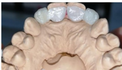
Figure 6 IPS emax single-unit cantilevered bridges.