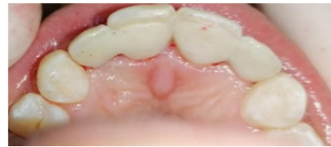
Figure 7 Intra-oral trying of the restorations.