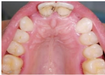
Figure 3 Palatal scheme of the preparation.

Since the occlusal bite in the anterior teeth was located in the third incisal of the palatal surface of maxillary teeth, we have retained the indication of a cantilevered RBFDP. We selected central incisors as abutment teeth since they provide sufficient surface area for bonding with their overall length. The occlusal scheme was marked with an articulator paper to identify impact points. Our preparation limits were then located behind these impact points. (Figure 3) Teeth preparation was entirely restricted to the enamel surface. Palatal surfaces of maxillary central incisors are reduced with a round shaped bur about 0.7mm of the enamel are removed with a supra-gingival finish line (Figure 4).