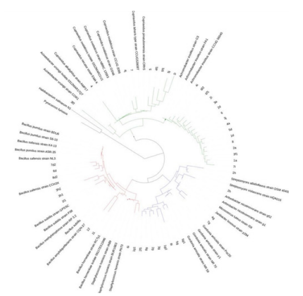
Figure 1 The phylogenetic tree was created through of metagenomic analysis of soil contaminated by 60,000 ppm of WMO, based on analysis of V3 hypervariable region of 16S rRNA. It is possible to see that A. denitrificans, B. horneckiae, B, subtilis and G. amicalis are distributed in strategic parts of this tree.

B. cereus strain 2 isolated from soil contaminated by 80,000 ppm of WMO, was located in a different branch associated with other types of species of the Bacillus genus such as B. thuringiensis that has the ability to synthesize biodetergents and lipid activity (Figure 2). These suggests that in nature, the hydrocarbon mixtures as well as WMO, could be used as carbon energy source and makes this genus be necessary by its capacity to colonize soil contaminated by WMO.<sup>7</sup>