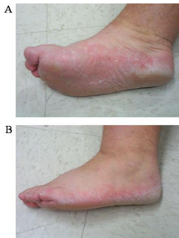
Figure 2 Bilateral moccasin type tinea pedis lesions. Moccasin type tinea pedis is a more prolonged form of tinea infection that surrounds the sole and lateral aspects of the foot in a slipper or moccasin distribution. 2A shows hyperkeratotic skin on the medial and bottom portions of the foot. 2B shows moccasin type tinea pedis on the lateral portion of the foot.