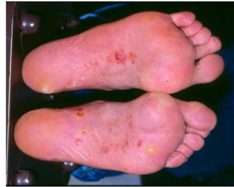
Figure 3 Vesiculobullous type tinea pedis on the plantar surface of the feet. This type of tinea pedis usually causes pustules or vesicles on the instep and plantar surfaces of the feet. Bacterial infection should be ruled out by microscopy or culture.

dermatophytosis is most often caused by T. rubrum as well. The differential diagnosis to be considered here are psoriasis; dyshidrotic, atopic, or allergic eczematous dermatitis; pitted keratolysis; and various keratodermas [14]. This form responds to itraconazole and other antifungal agents.